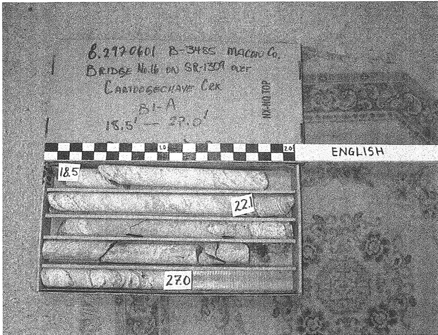
B-3485 8.2970601 Bridge No.16 on SR-1309 over Cartoogechaye Creek Macon County