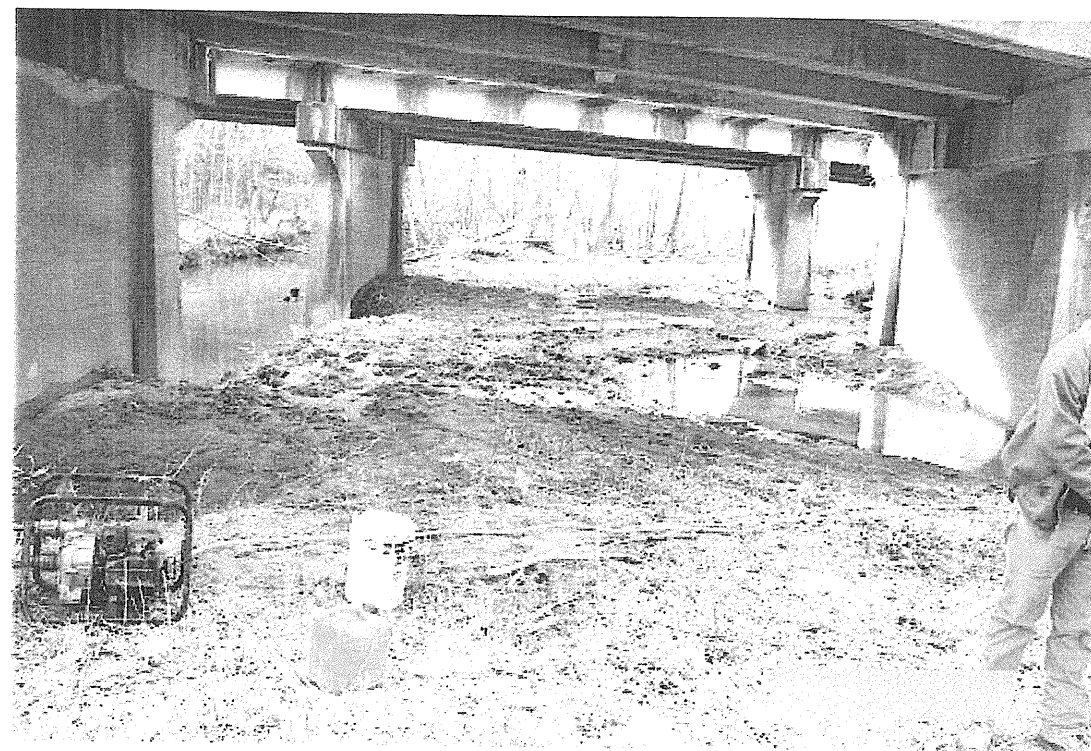
Photograph 4: View Along Bent-1 From Left to Right