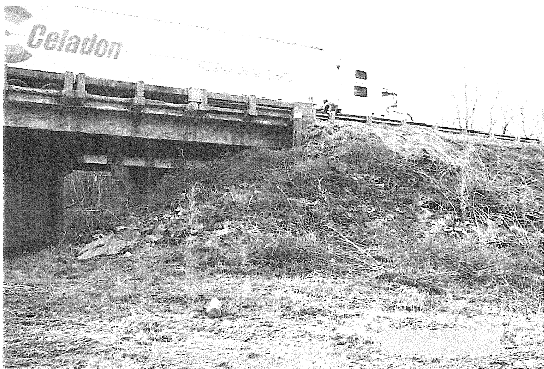
Photograph 2: View Along End Bent-1 From Left to Right From Bottom of Embankment