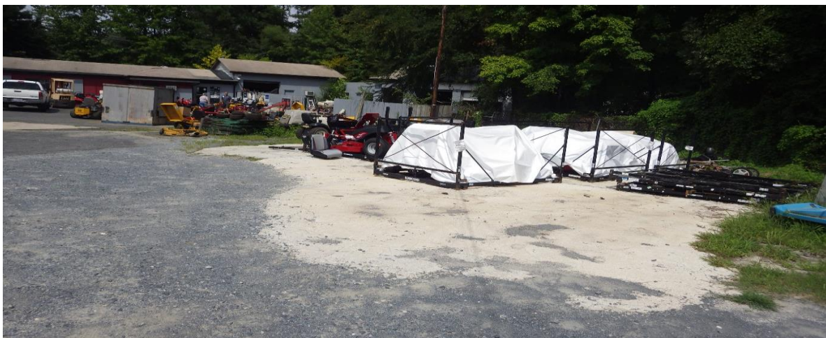
Possible former UST (removed) area.

This is an auto and small engine repair shop. A 2000 gallon UST was reportedly installed in 1981 and removed in 1991. No monitoring wells observed on site and no record in NCDEQ's database.