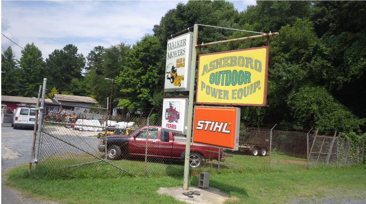
Anticipated Impacts: LOW

This is an auto and small engine repair shop. A 2000 gallon UST was reportedly installed in 1981 and removed in 1991. No monitoring wells observed on site and no record in NCDEQ's database.