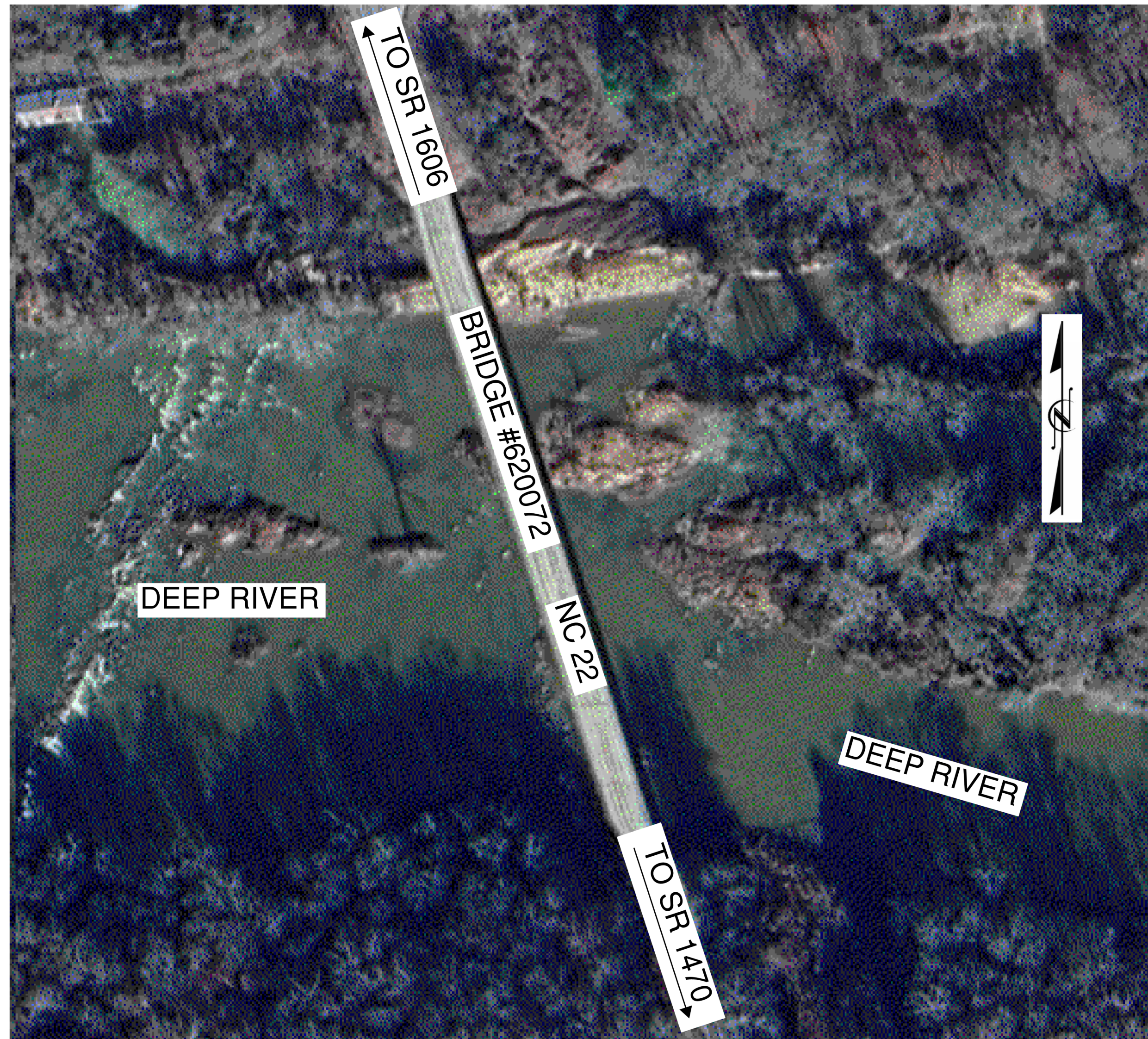
BRIDGE 620072 - LATITUDE: 35°28'41.54"; LONGITUDE: 79°31'11.52"