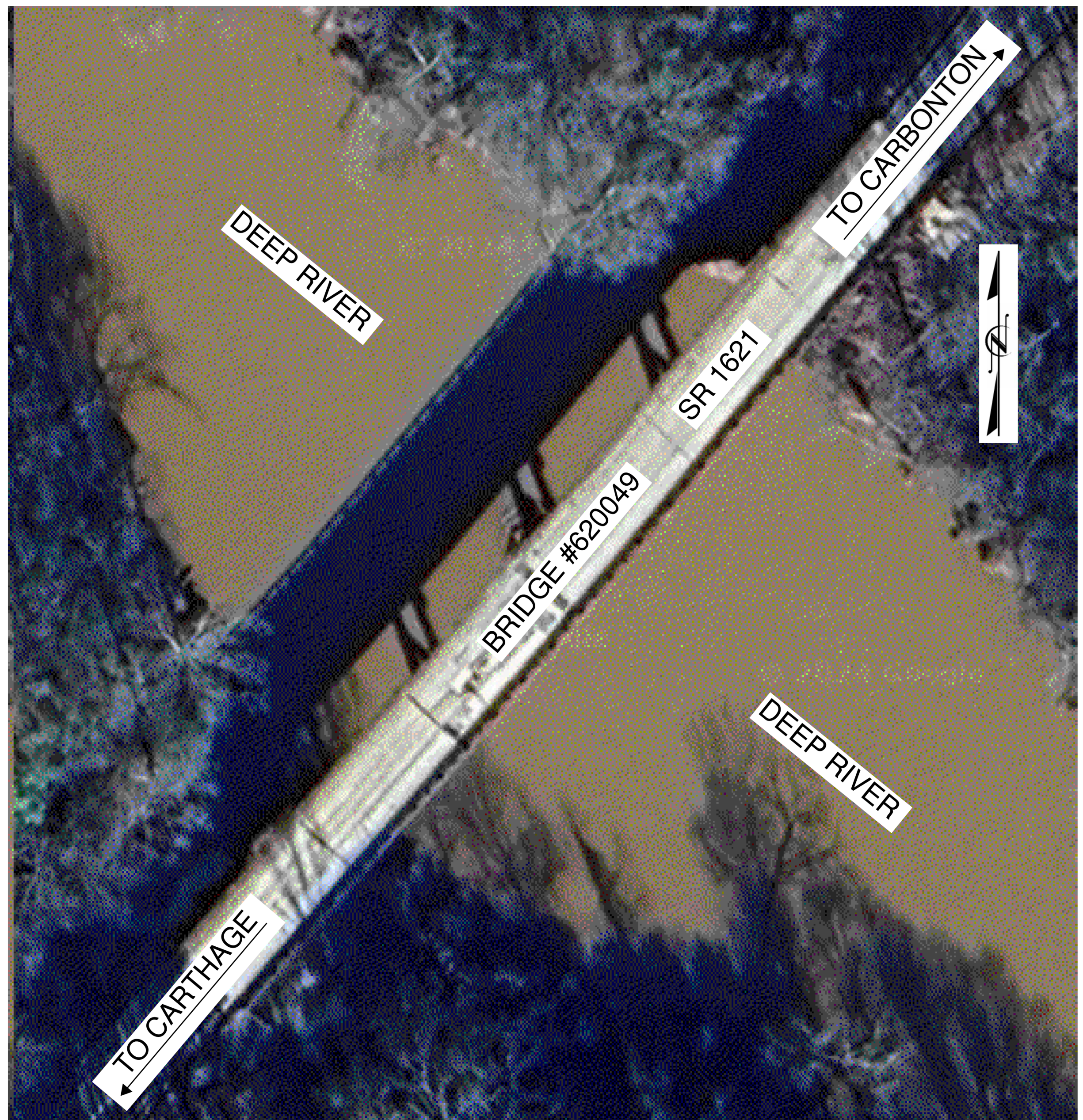
BRIDGE 620049 - LATITUDE: 35°27'26.23"; LONGITUDE: 79°22'49.73"