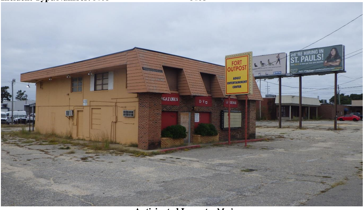
Anticipated Impacts: Med

This site currently a vacant building. It is the former location of One Hour Martinizing (Dry Cleaner). It is located on the south side of Bragg Blvd approximately 980 feet west of Villagio Pl. The address is not listed in the DSCA database. Two monitoring wells were observed during the site investigation.