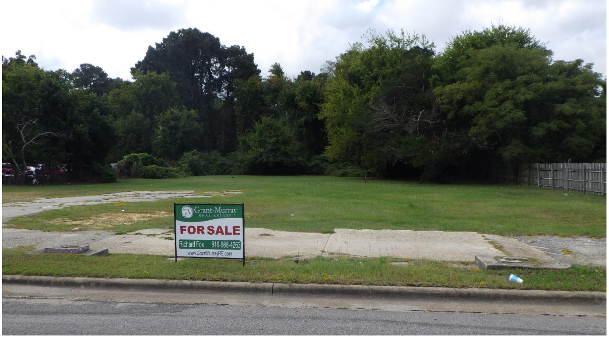
Anticipated Impacts: Low

This site is currently a vacant lot. It is the former location of Lee's Lounge. It is located on the south side of Fort Bragg Rd at the Bragg Blvd intersection. One pump island with fill port was observed during the site investigation. The pump island appears to be within the existing NCDOT right of way. The address is not listed in the DEQ UST section registry and there are no known incidents associated with it.