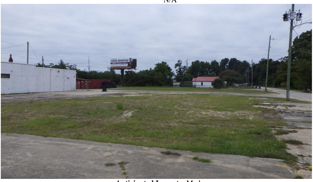
Anticipated Impacts: Med

This site is currently a vacant lot. It is the former location of A & H Cleaners. It is located on the southeast quadrant of Joseph St and Bragg Blvd. A phase II investigation was conducted on the property under TIP U-3423 in October 2009. The phase II report indicated no USTs within the area investigated. Tetrachloroethene (dry cleaning solvent) was detected in one boring at shallow depths. The site is not listed in the DSCA database.