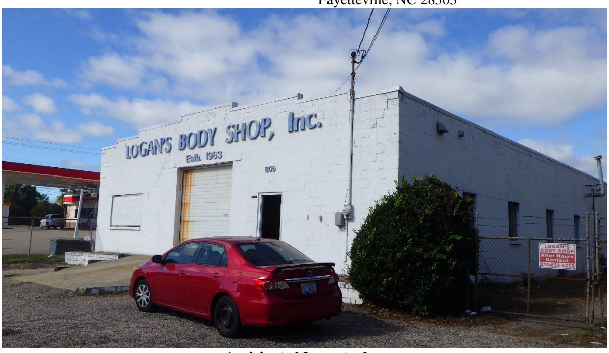
Anticipated Impacts: Low

This site currently operates as a auto paint and body shop. It is located on the west side of Cain Rd approximately 250 north of Bragg Blvd. According to the DEQ UST section registry there is one heating oil UST in use. There are no known incidents associated with this facility. No monitoring wells were observed during the site investigation.