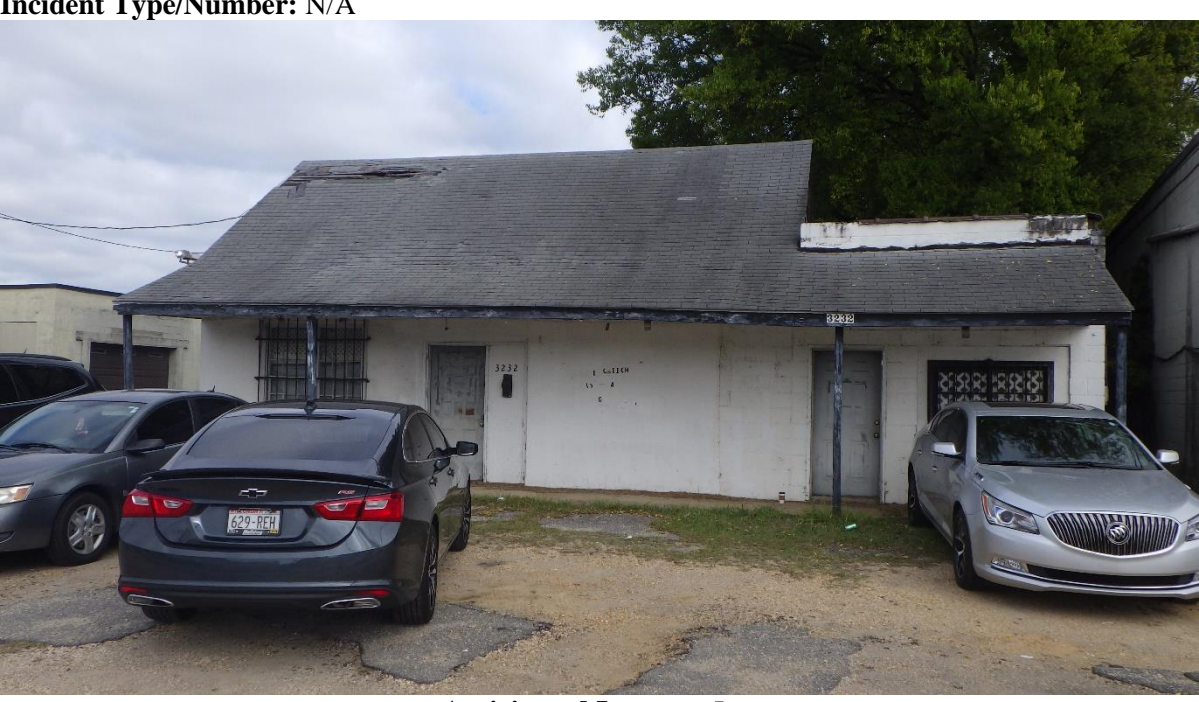
Anticipated Impacts: Low

The buildings on this site were vacant at the time of the site investigation. The property is located on the north side of Bragg Blvd approximately 250 feet east of William Clark Rd. The design of the buildings suggest they once operated as a gas station and auto repair shop. The address is not listed in the DEQ UST registry and there are no known incidents associated with it. No evidence of USTs or UST removal was observed during the site investigation.