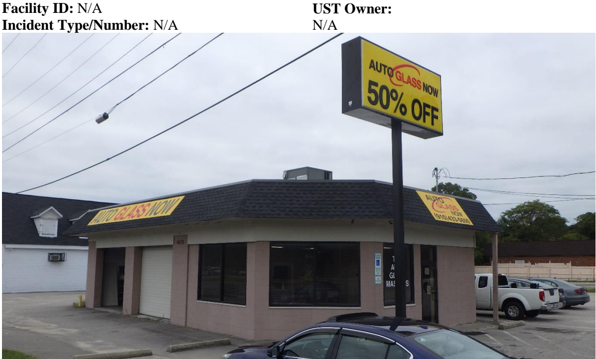
Anticipated Impacts: Low

This site is currently an auto glass repair business. It is possible it once operated as a gas station. It is located on the southeast quadrant of Swain St and Bragg Blvd. A phase II investigation was conducted on this property under TIP U-3423 in October 2009. The phase II report indicated four (4) probable USTs and no soil contamination. The address is not listed in the DEQ UST section registry and no monitoring wells were observed during the site investigation.