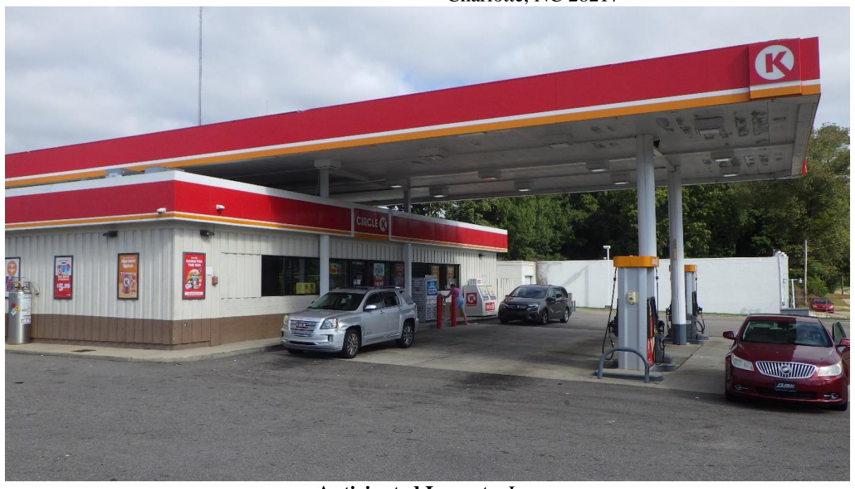
Anticipated Impacts: Low

Circle K Stores 2550 W Tyvola Rd Suite 200 Charlotte, NC 28217