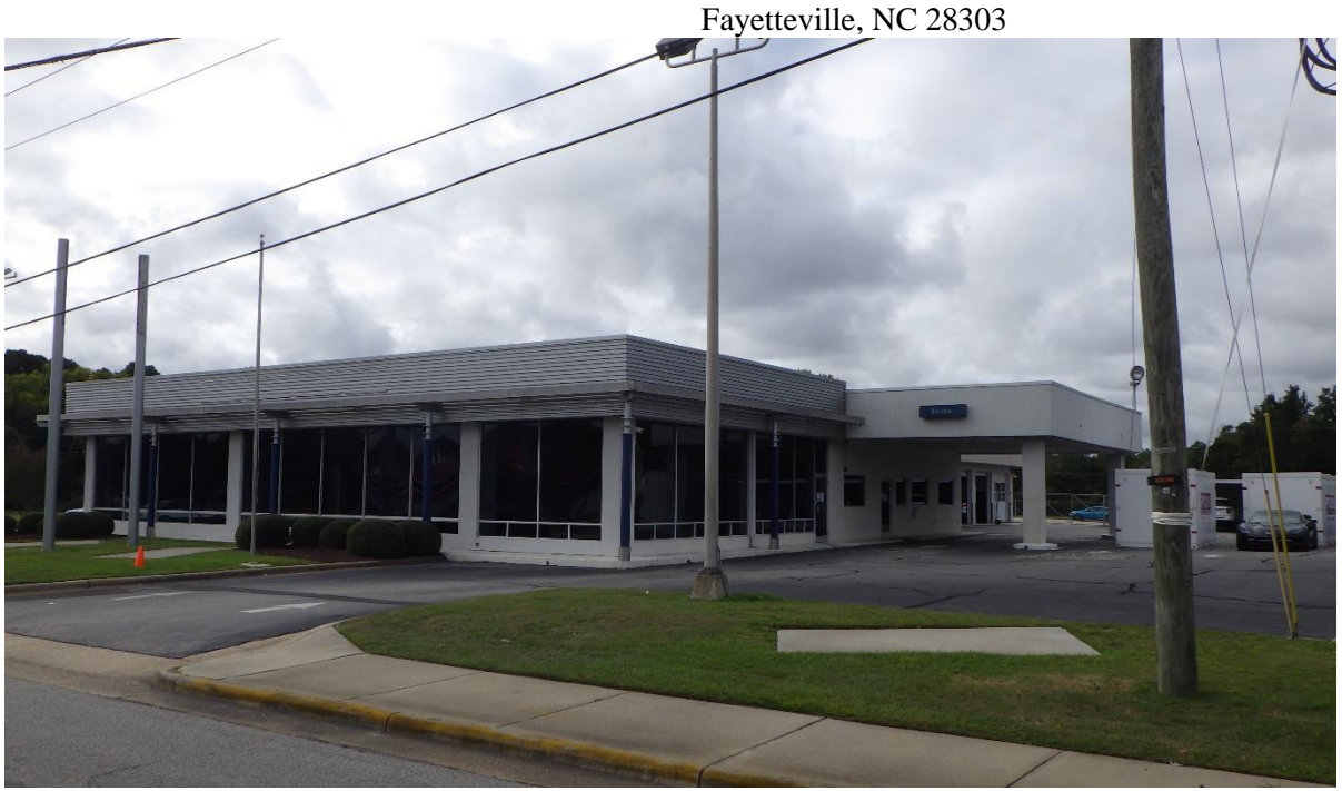
Anticipated Impacts: Low

This site is two parcels and is currently owned by Fayetteville Technical Community College. It is the Former Valley Motors dealerships. According to the DEQ Laserfiche site nine UST were removed from the site in 2016. All of the USTs were located behind the building outside the proposed study. Incident #'s 29987 and 42264 are associated with the site and were closed out in 2020 with a "No Further Action". There is a "Notice of Residual Petroleum attached to the deed. Four monitoring wells were observed during the site investigation.