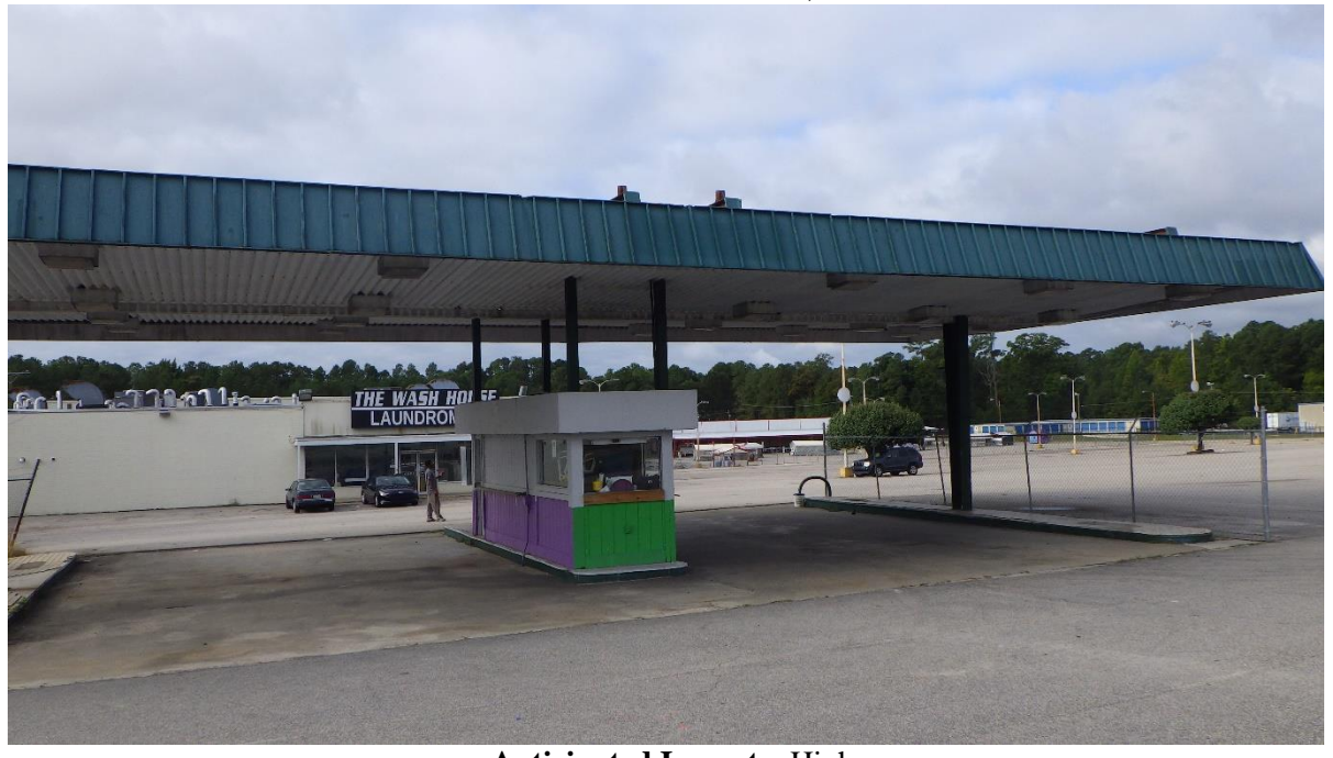
Anticipated Impacts: High

This parcel has both a vacant gas station and an active dry cleaner. It is located on the south side of Bragg Blvd approximately 920 feet west of Front Bragg Rd. According to the DEQ UST registry four UST were removed in 1989. Incident # 5678 is associated with the former Conoco gas station and was closed out in 2007. A Notice of residual petroleum is attached to the deed for petroleum contamination associated with the gas station. There is an active dry cleaner on the property (3311 Bragg Blvd) and is listed in the DSCA database. The dry cleaner's is behind the former gas station. Several monitoring wells were observed on this parcel and the adjoining property to the east. The monitoring wells may be associated with the dry cleaners.