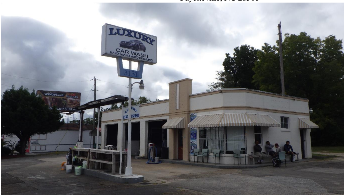
Anticipated Impacts: Low

1709 Clinton Rd Box 53157 Fayetteville, NC 28301