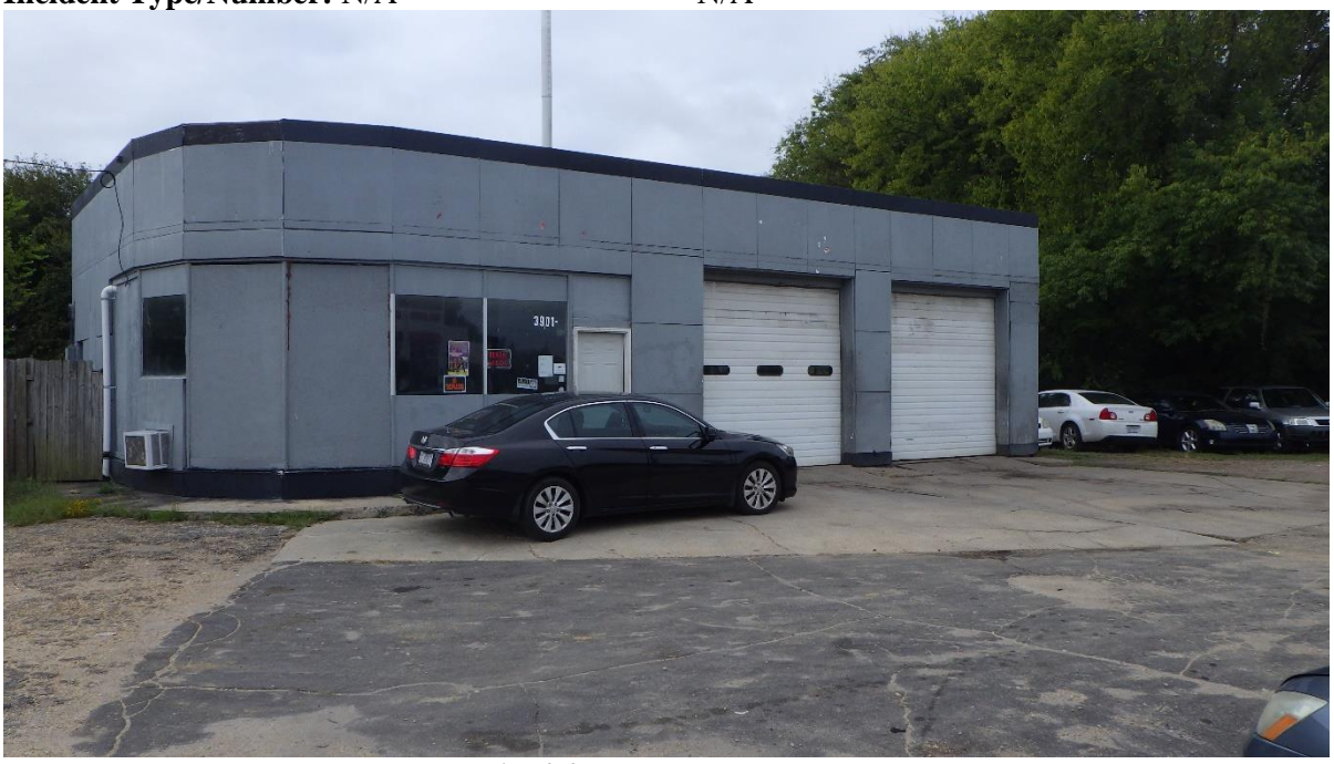
Anticipated Impacts: Low

This site currently operates as a used car dealer. It is located on the south side of Bragg Blvd approximately 230 feet west of Bargain St. The design of the building suggest it once operated as a gas station. There is a possible pump island on the northwest corner of the building. The address is not listed in the DEQ UST section registry. No monitoring wells were observed during the site investigation.