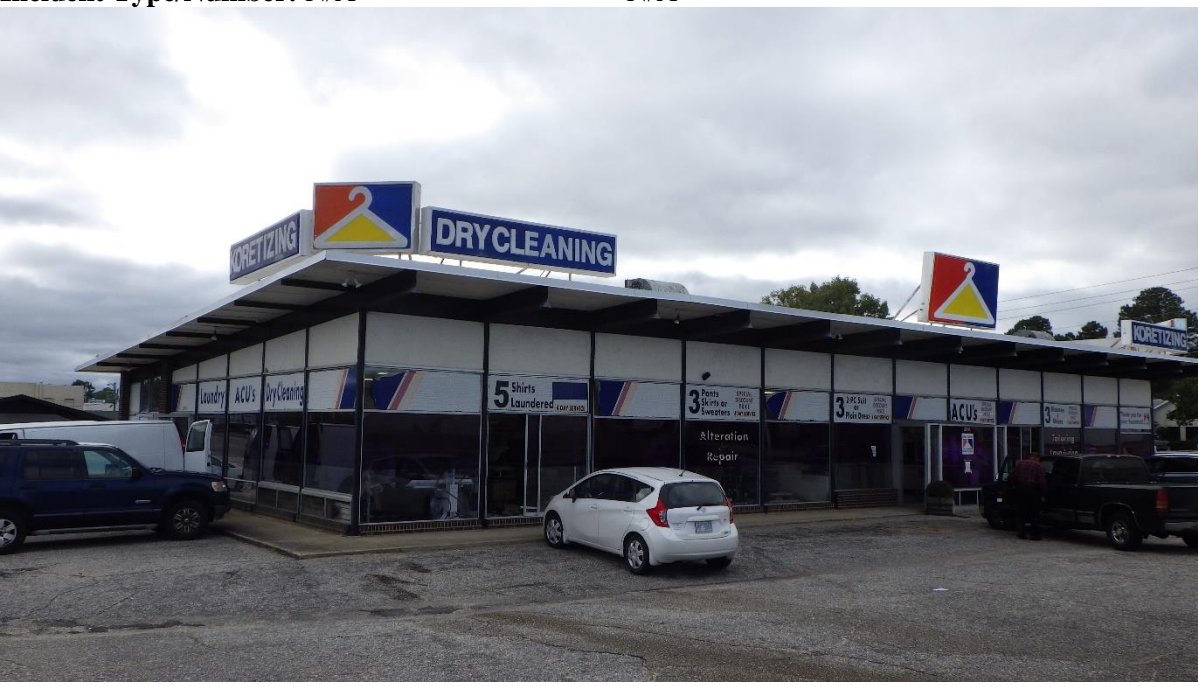
Anticipated Impacts: High

This site currently operates as a dry-cleaning facility. It is located on the south side of Bragg Blvd approximately 730 feet east of Cain Rd. The facility does on-site dry cleaning. The address is not listed in the DSCA database and there are no known incidents associated with it. No monitoring wells were observed during the site investigation.