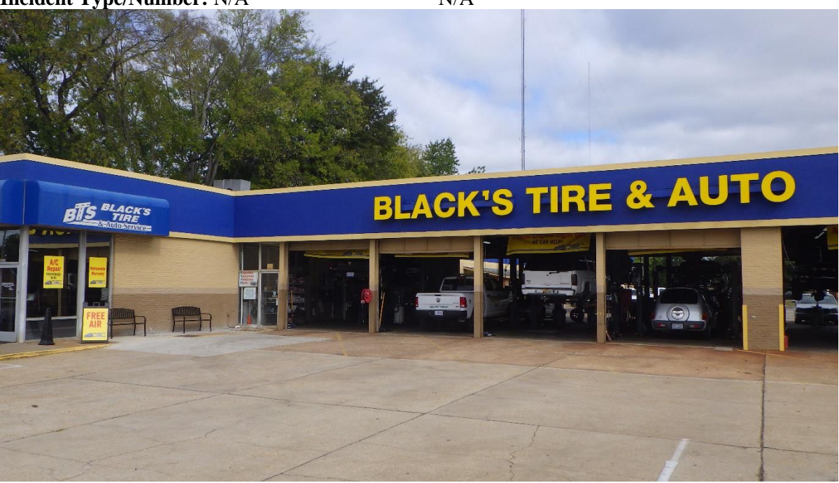
Anticipated Impacts: Low

This site currently operates as an auto repair shop. It is located on the north side of Bragg Blvd approximately 370 feet east of William Clark Rd. The Address is not listed in the DEQ UST registry and there are no know incidents associated with it. The facility once operated inground hydraulic lifts. All of the inground lifts appeared to be grouted over. The facility currently uses above ground lifts. No other evidence of USTs or monitoring wells were observed during the site investigation.