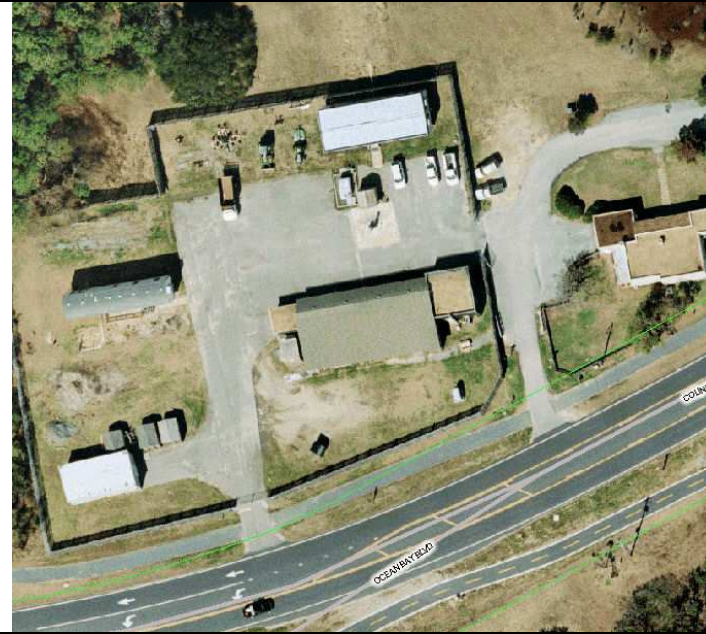
Site 4: Wright Brothers Memorial Maintenance Shop. Dare County GIS aerial photography.