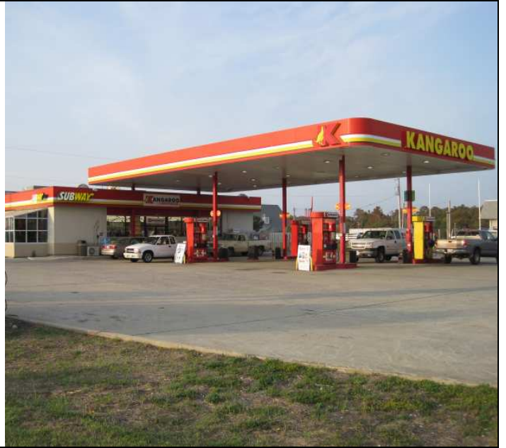
Site 5: Pantry 3854 – Kangaroo Express. View to the south.