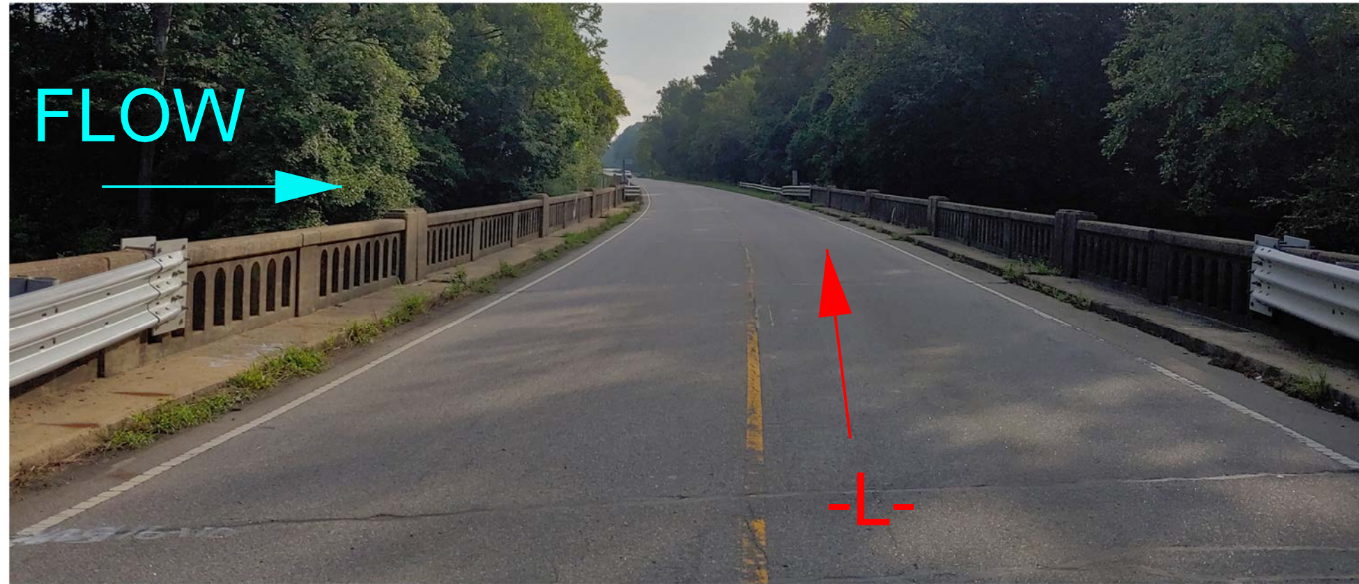
LOOKING EAST FROM END BENT 1 TOWARD END BENT 2

REPLACE BRIDGE NO. 320087 OVER SWIFT CREEK ON NC 97