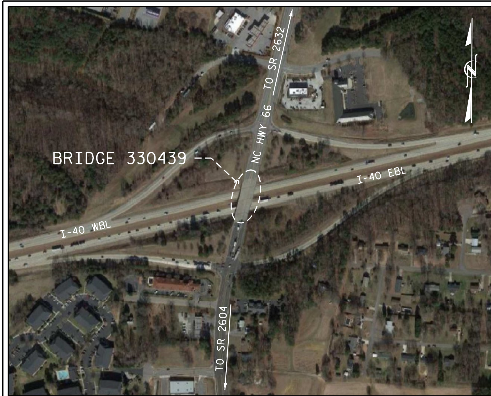
BRIDGE 330439 LOCATION SKETCH

INFORMATION INDICATED ON THE LOCATION SKETCH SHALL BE CONSIDERED GENERAL INFORMATION ONLY. THE CONTRACTOR SHALL CONFIRM, THROUGH OTHER SOURCES, SPECIFIC INFORMATION REGARDING BRIDGES, ROADWAYS, UTILITIES, THE SURROUNDING AREA, AND ANY OTHER ASPECTS THAT MAY BE NECESSARY TO PERFORM AND COMPLETE THE PROJECT.