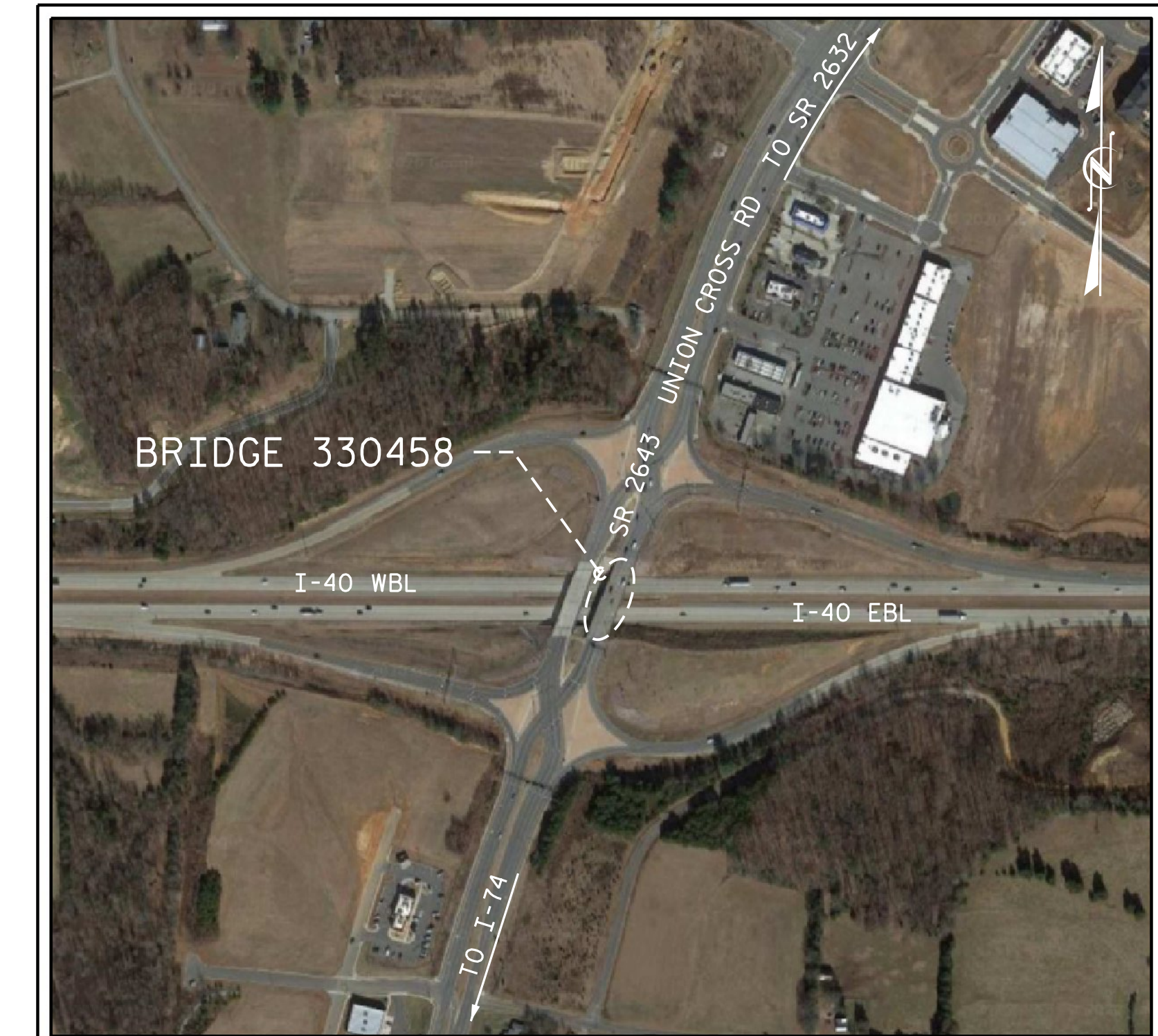
BRIDGE 330458 LOCATION SKETCH