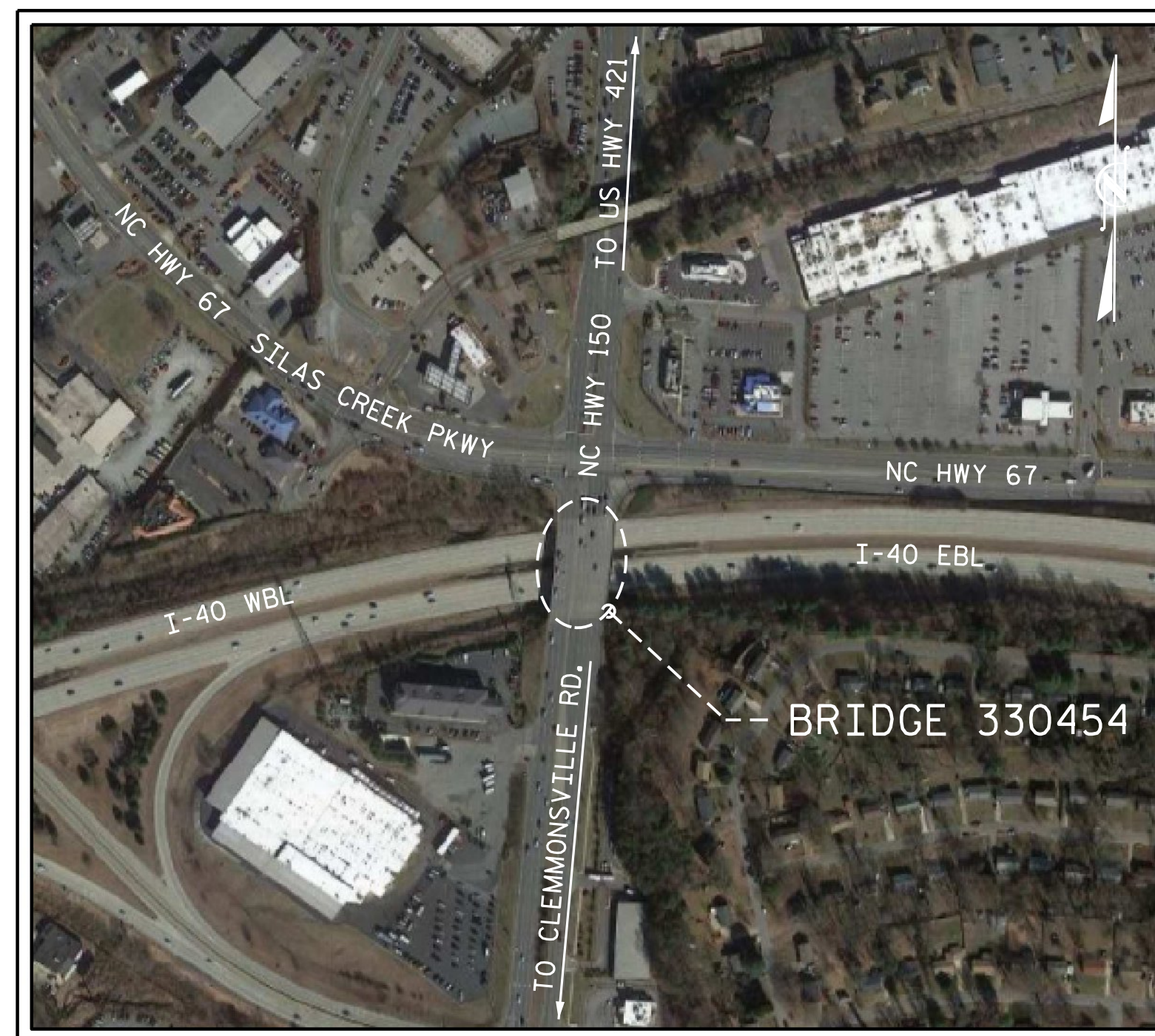
BRIDGE 330454 LOCATION SKETCH