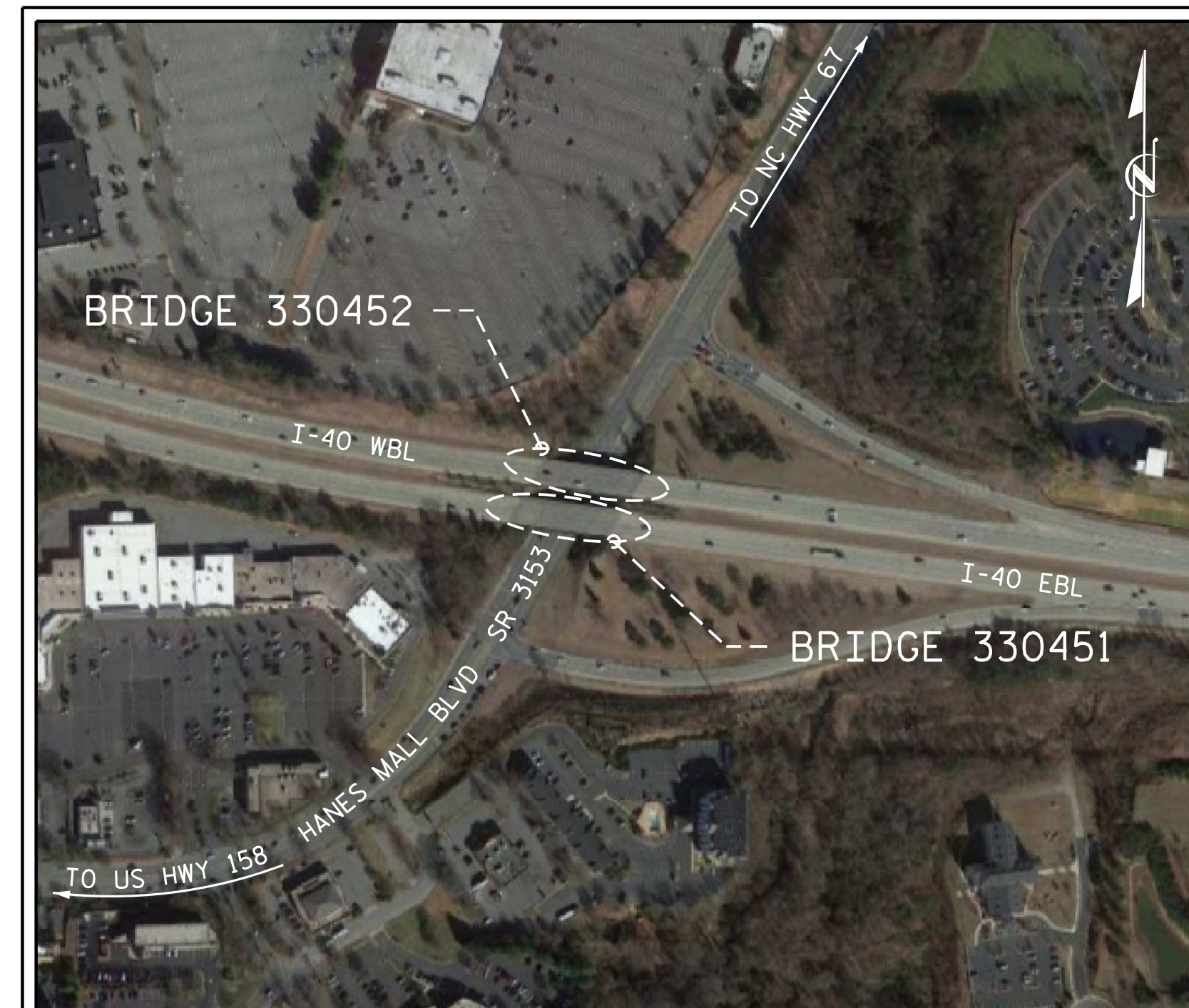
BRIDGES 330451 & 330452 LOCATION SKETCH