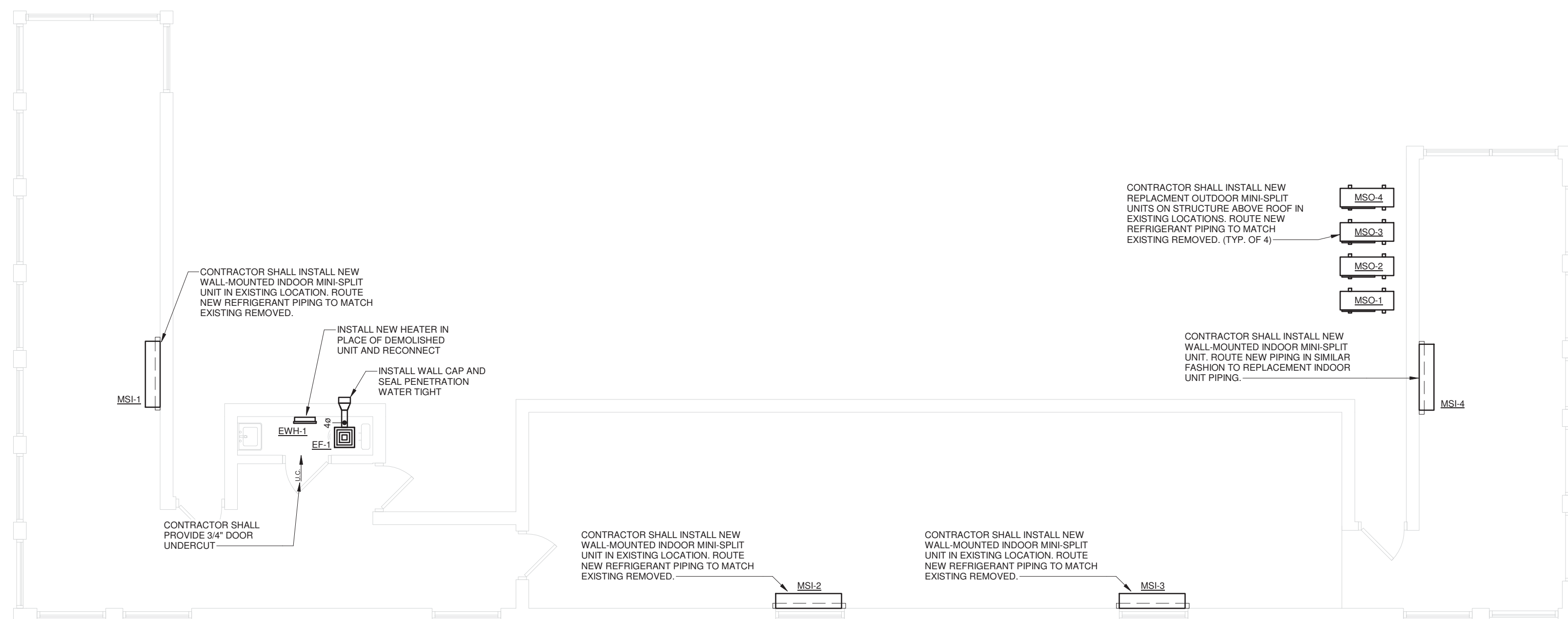
1 CONTROL HOUSE PLAN - EAST TOWER - MECHANICAL M1.1 1/4" = 1'-0"