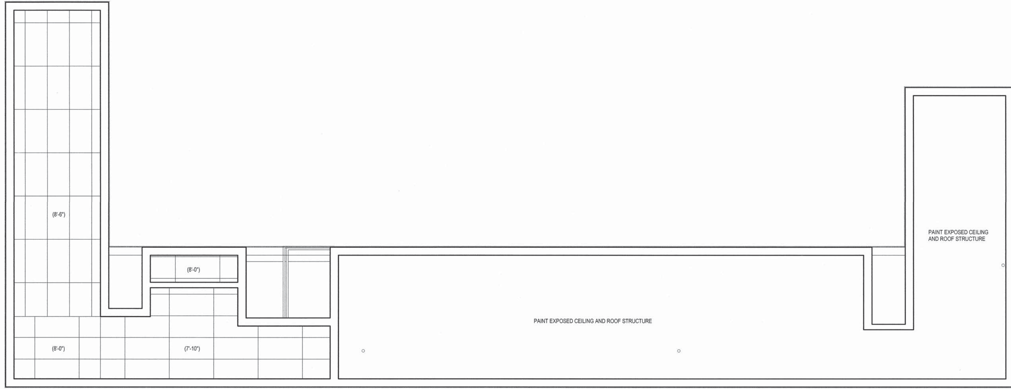
1 OVERALL REFLECTED CEILING PLAN A1.10 1/4" = 1'-0"