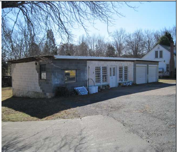
Site 4: Former gas station. View to the south.