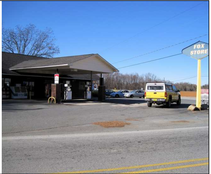
Site 2: Fox General Store. View to the northwest.