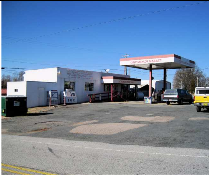
Site 1: Crossroads Market. View to the north.