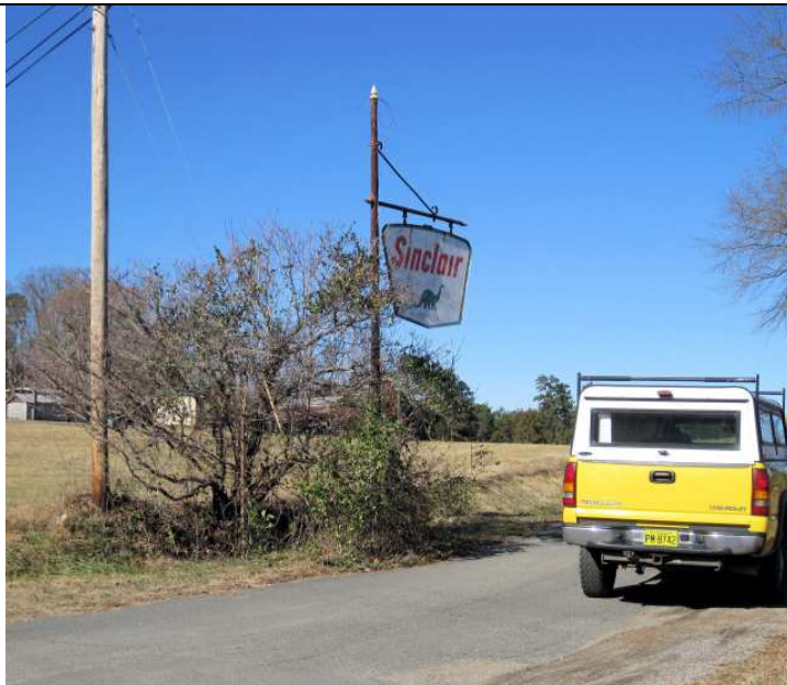
Site 3: Former gas station site. View to the north.