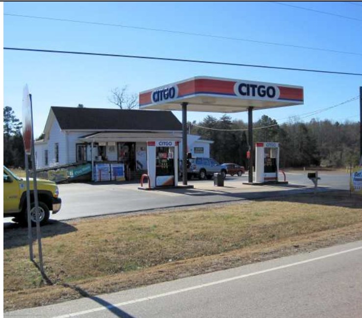
Site 5: Cheeseman's Grocery. View to the southwest.