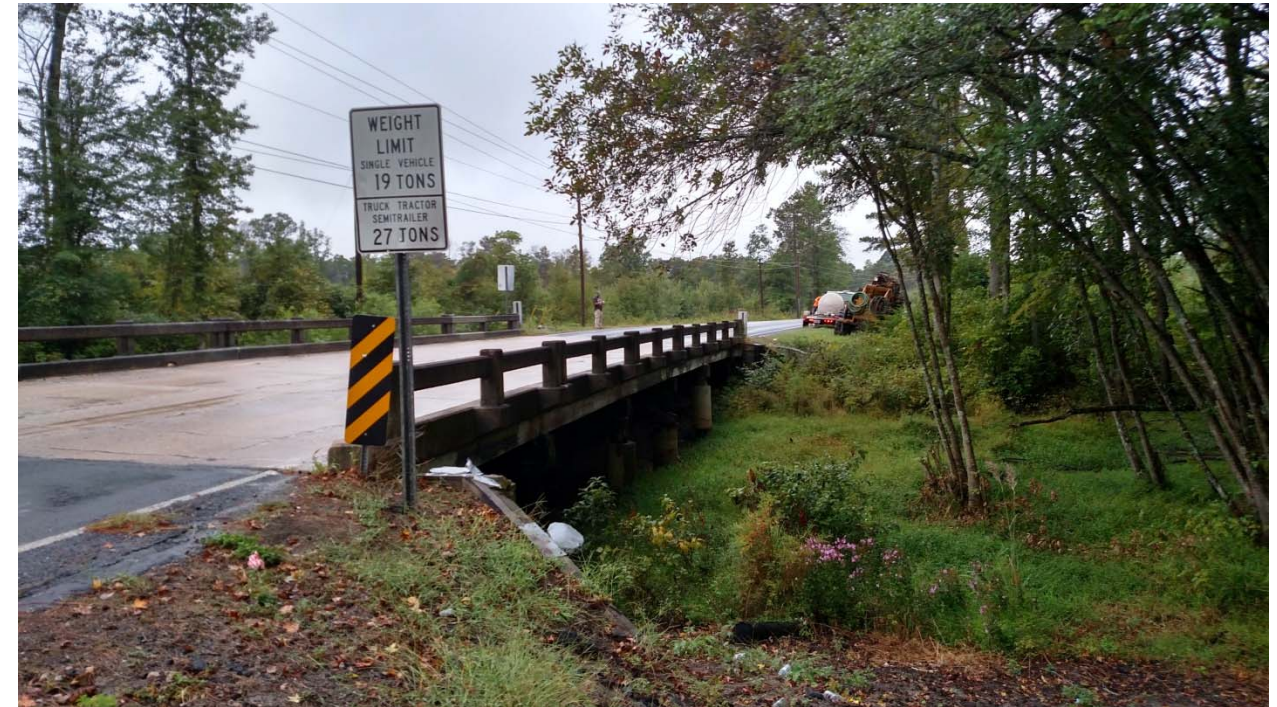
Photograph No. 3: View from End Bent 2 looking west