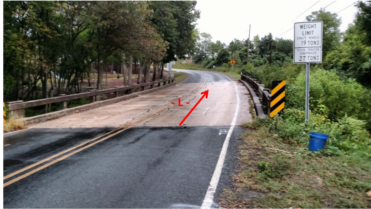
Photograph No. 1: View from End Bent 1 looking east