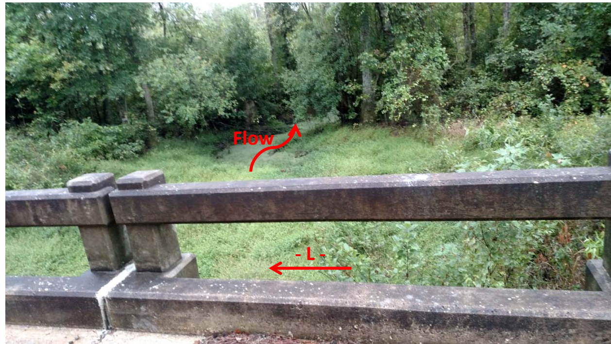
Photograph No. 2: View from the bridge looking downstream/south