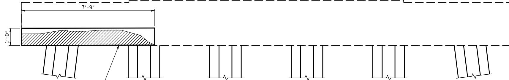
ELEVATION EAST FACE