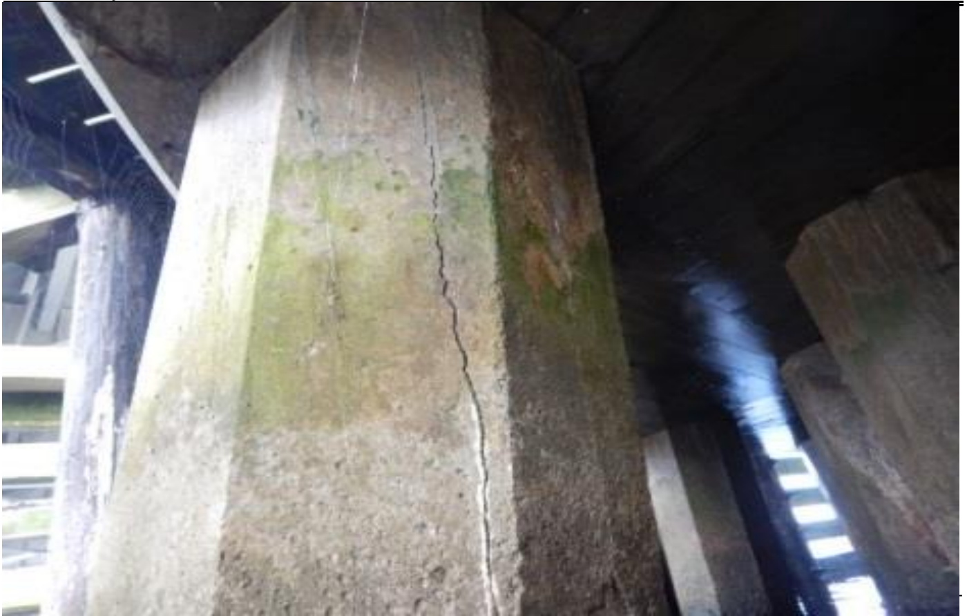
P-14, F-3,4,5, DELAM. 3" DEEP