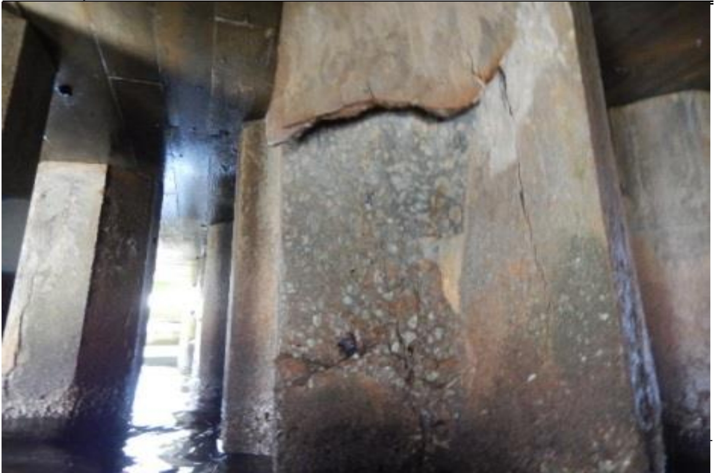
P-49, F-3,4,5,6,7, DELAM. 3" DEEP, FAILED REPAIR