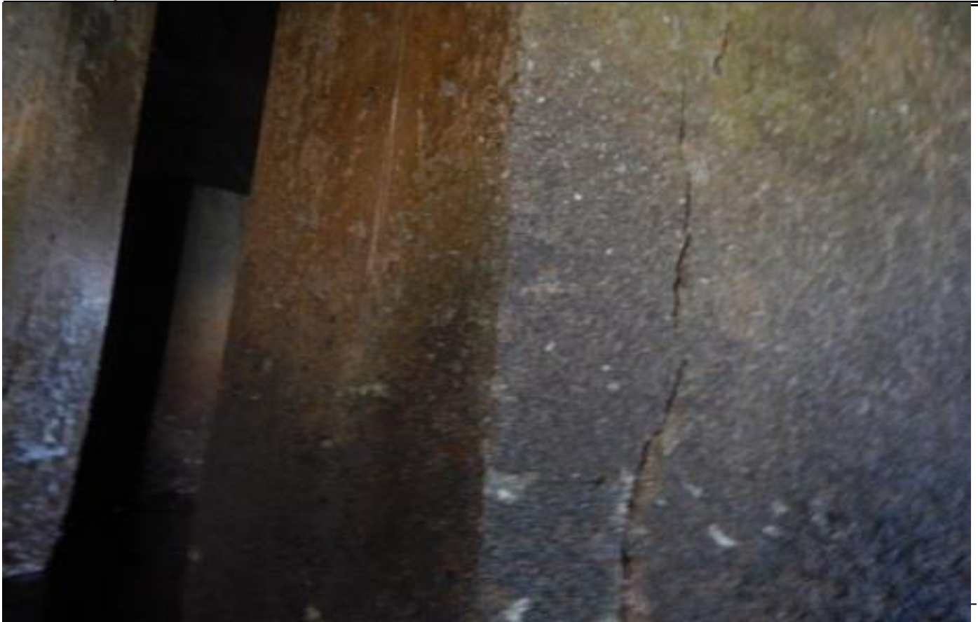
P-25, F-4,5, DELAM. 2" DEEP