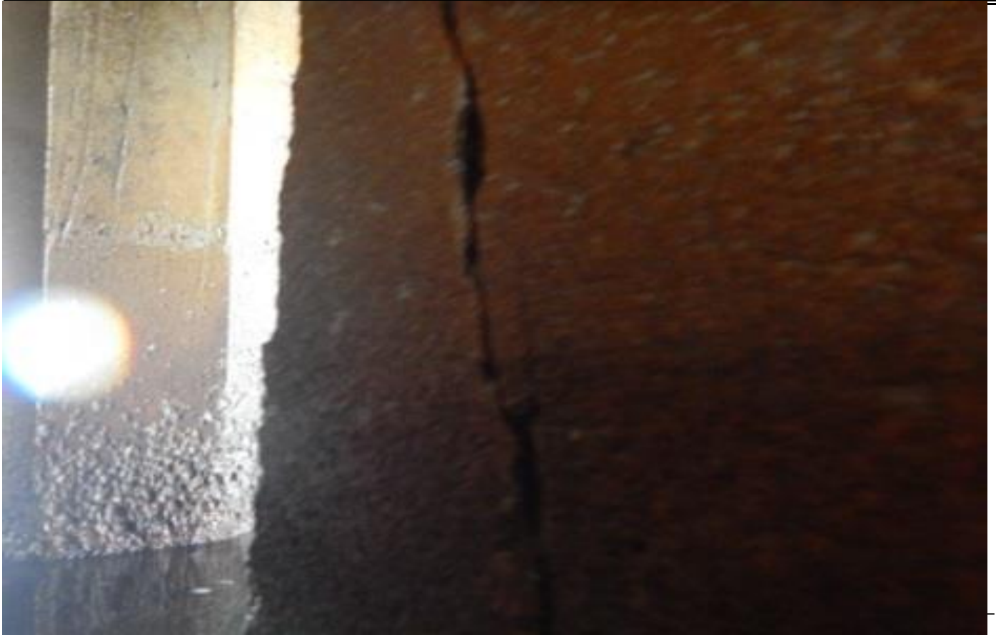
P-17, F-6,7,8, DELAM. 1" TO 2" DEEP