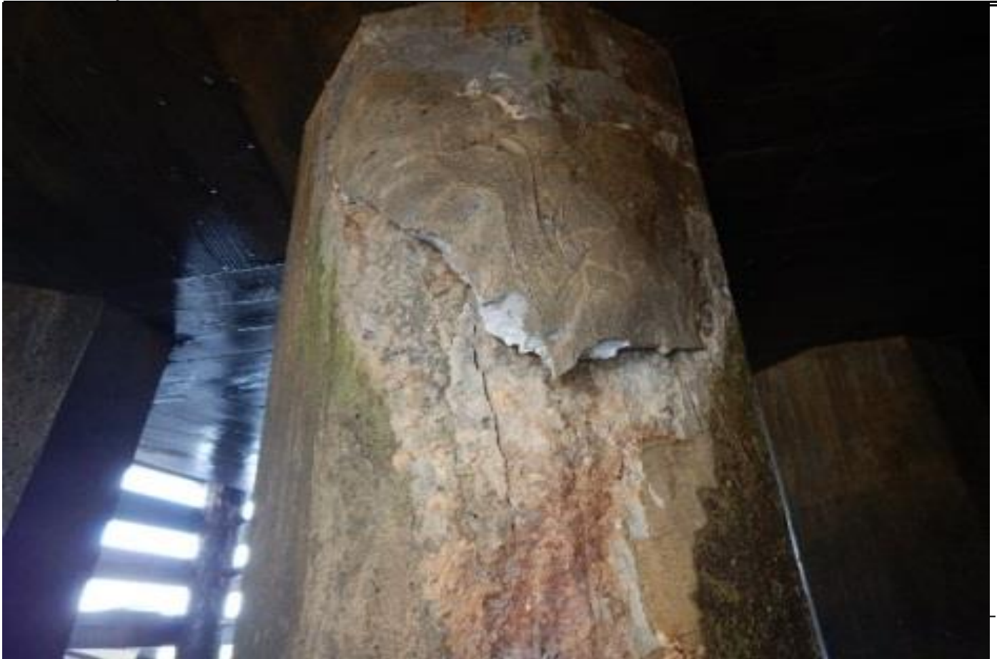
P-32, F-3,4,5,6,7,8, DELAM. 2"-3" DEEP, FAILED REPAIR