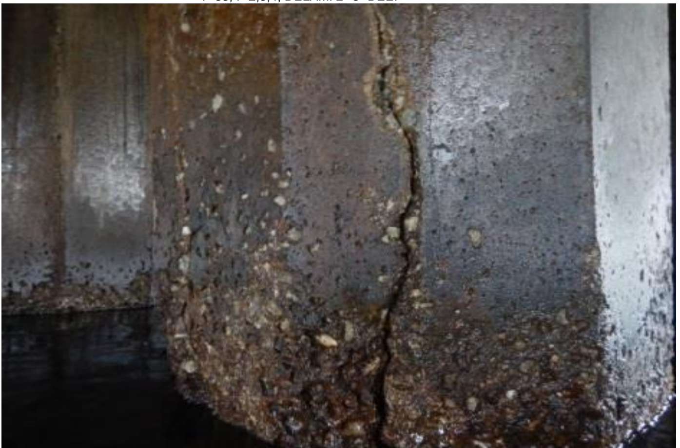
P-33, F-2,3,4, DELAM. 2"-3" DEEP