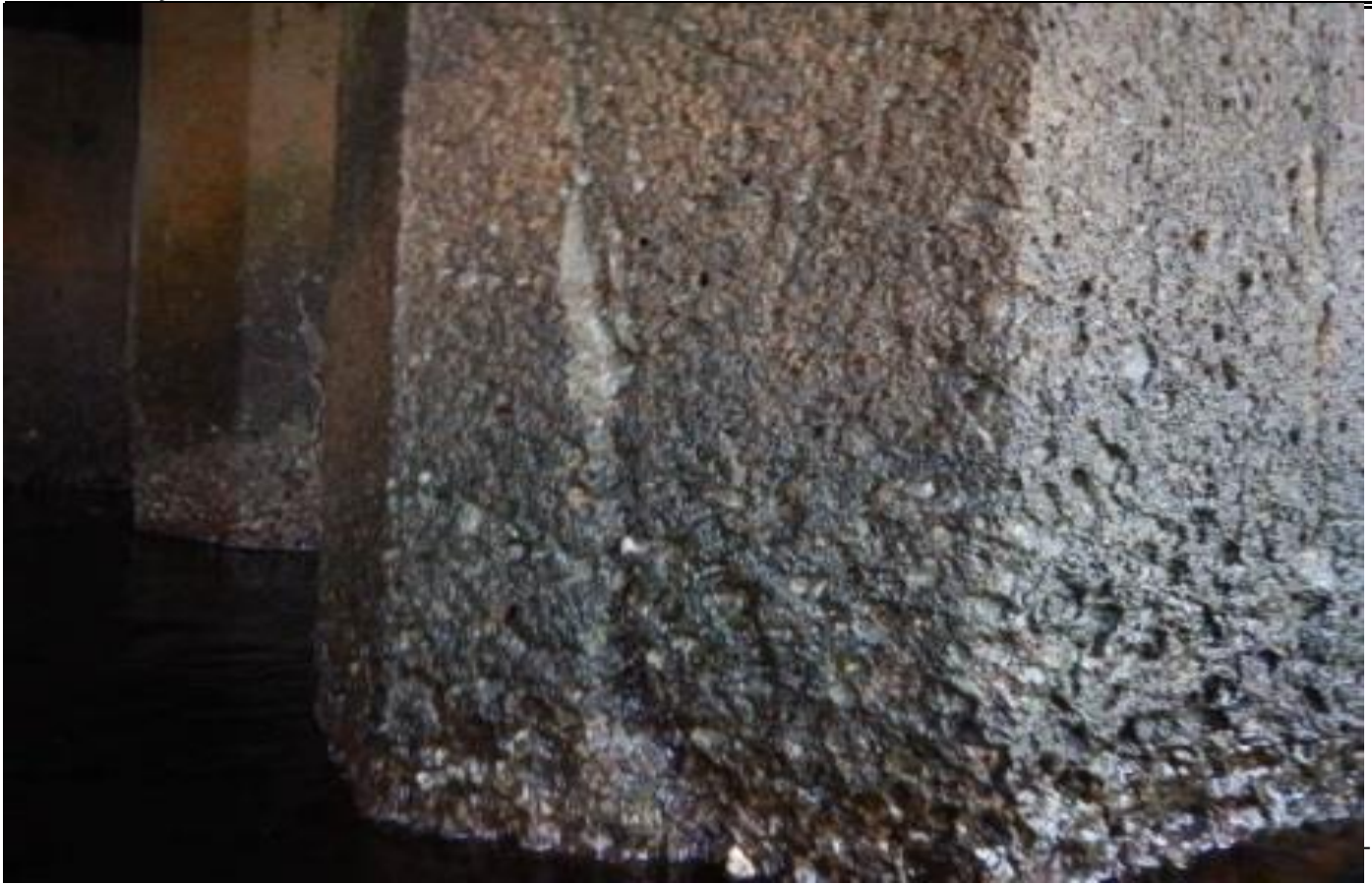
P-19, F-2,3, DELAM. 2" DEEP