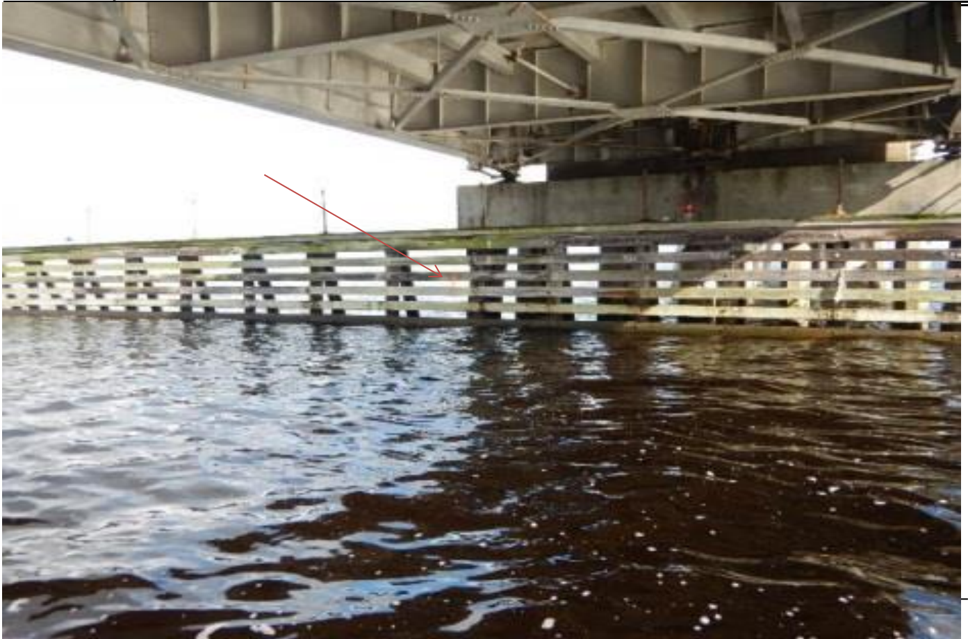
CABLE CROSSING AT EAST FENDER STATION 43, MARKED WITH FLAGGING TAPE