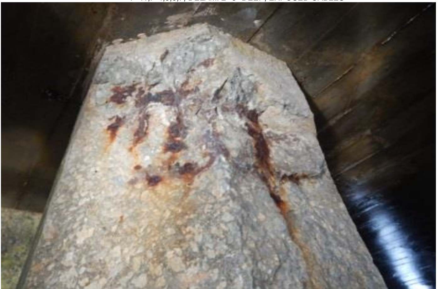
P-41, F-4,5,6,7, DELAM. 2"-3" DEEP, EXPOSED CABLES