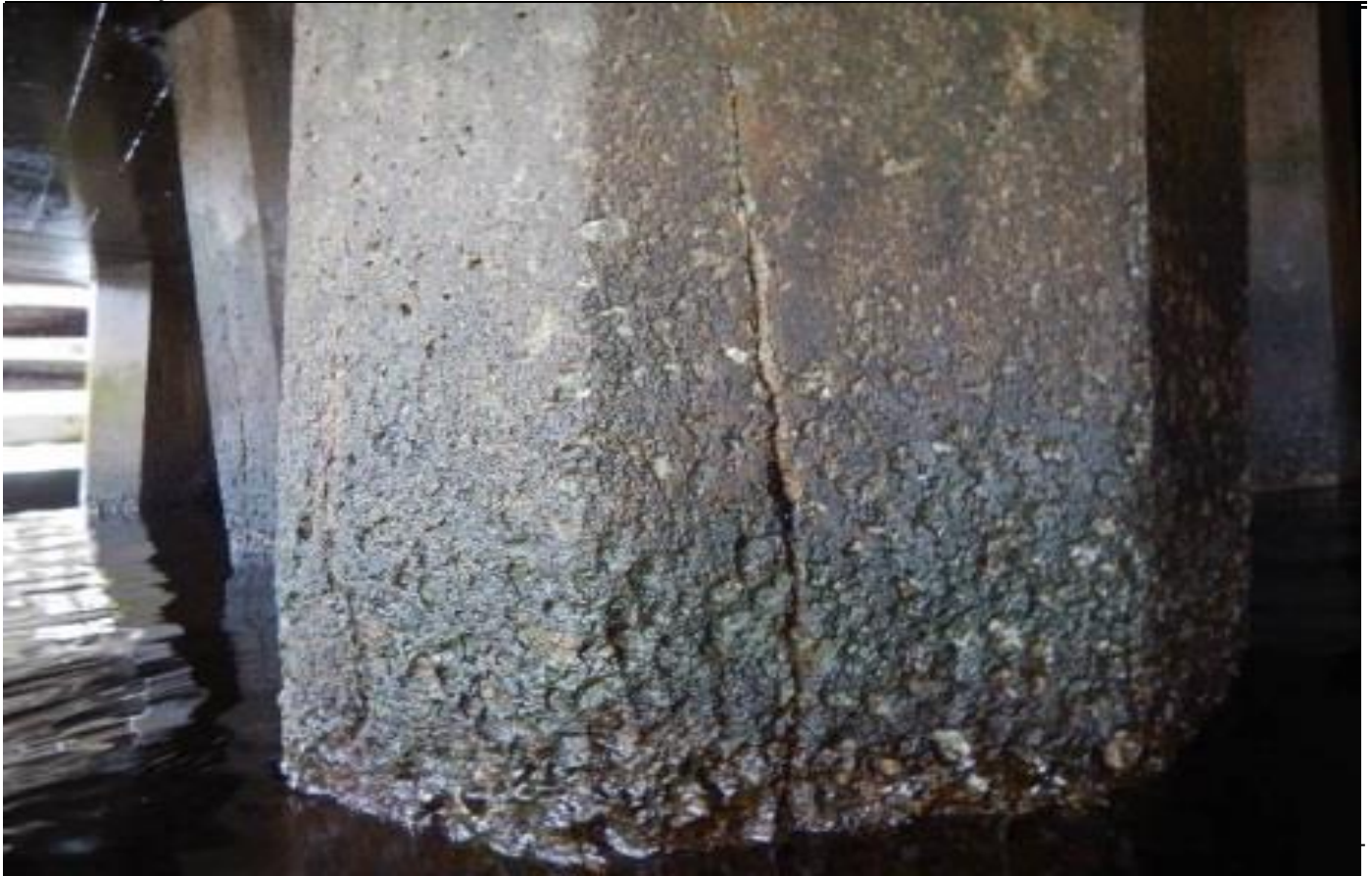
P-21, F-3,4,5, DELAM. 2" DEEP