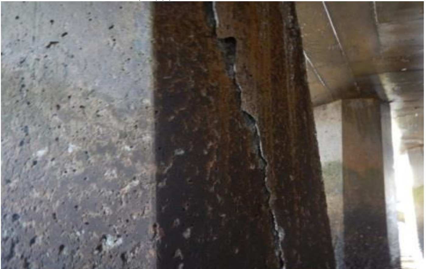
P-9, F-1,2,3, DELAM. 3" DEEP