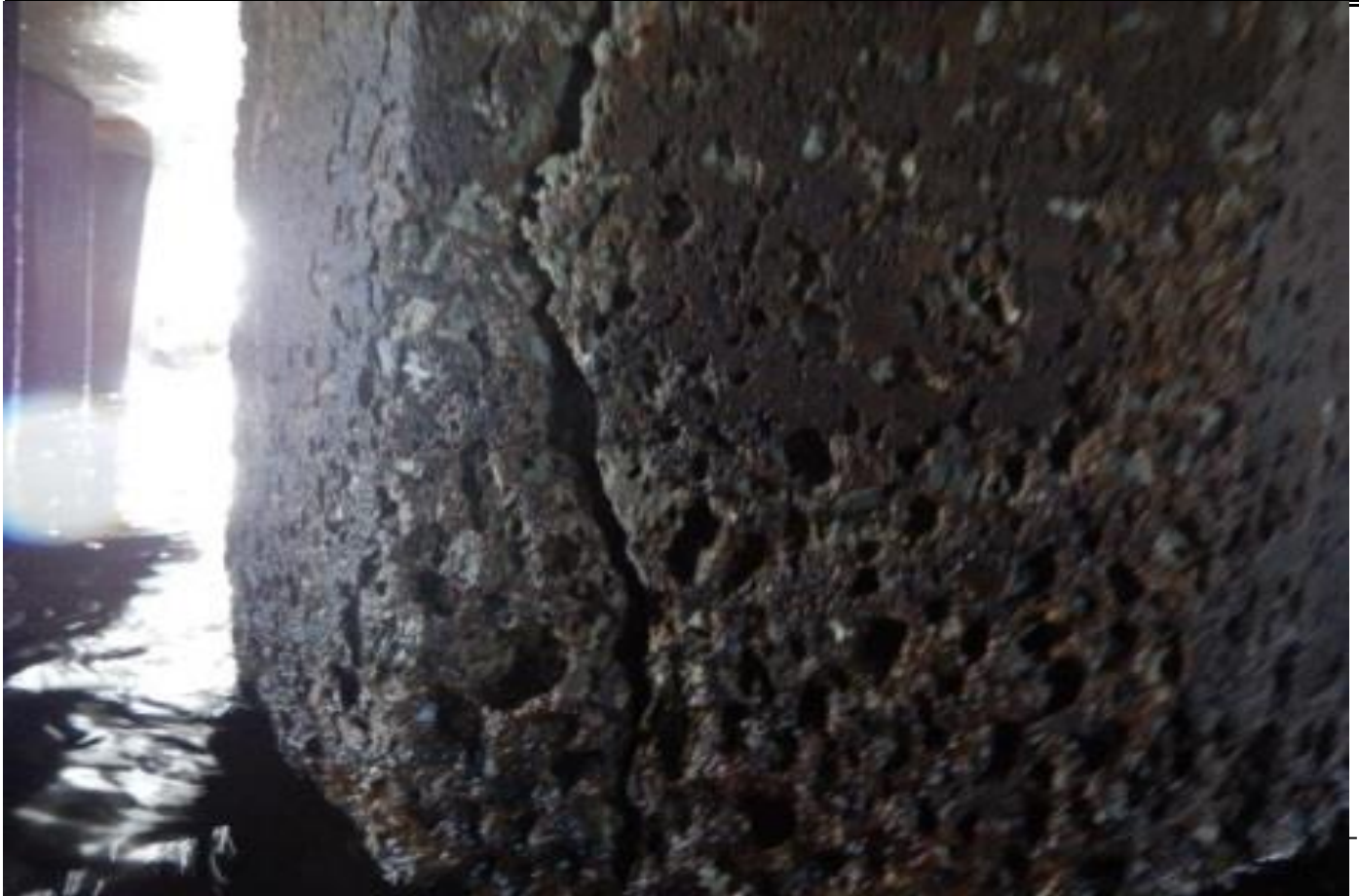
P-47, F-2,3,4, DELAM. 2" DEEP