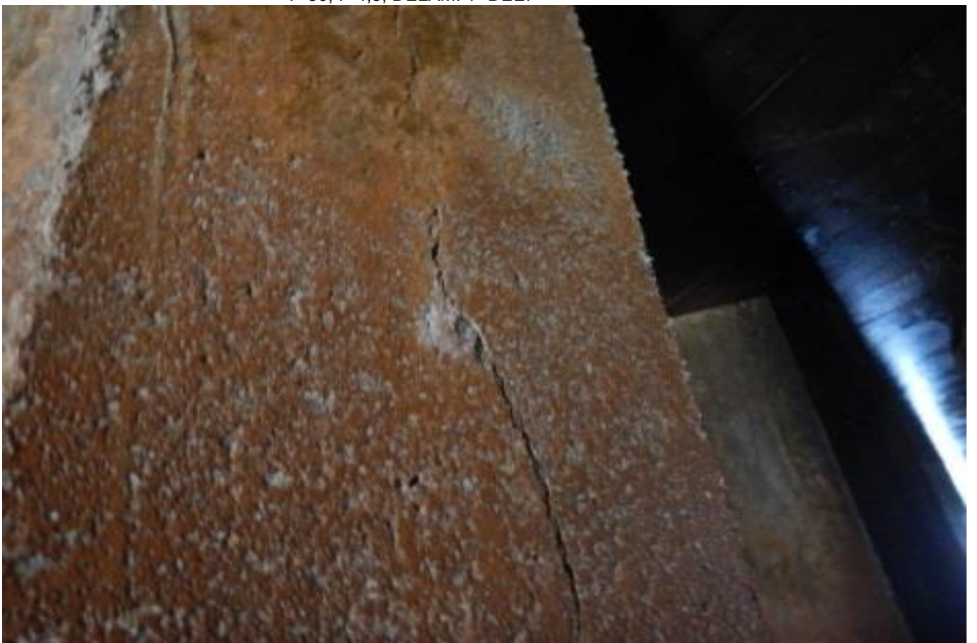
P-50, F-4,5, DELAM. 1" DEEP