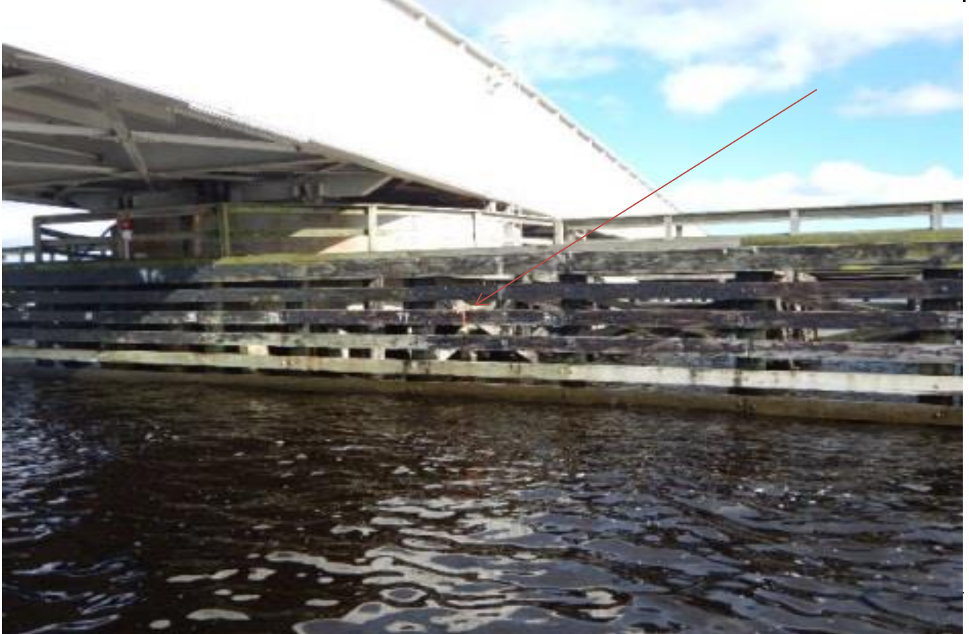
CABLE CROSSING WEST CHANNEL EAST SIDE STATION 79, MARKED WITH FLAGGING TAPE