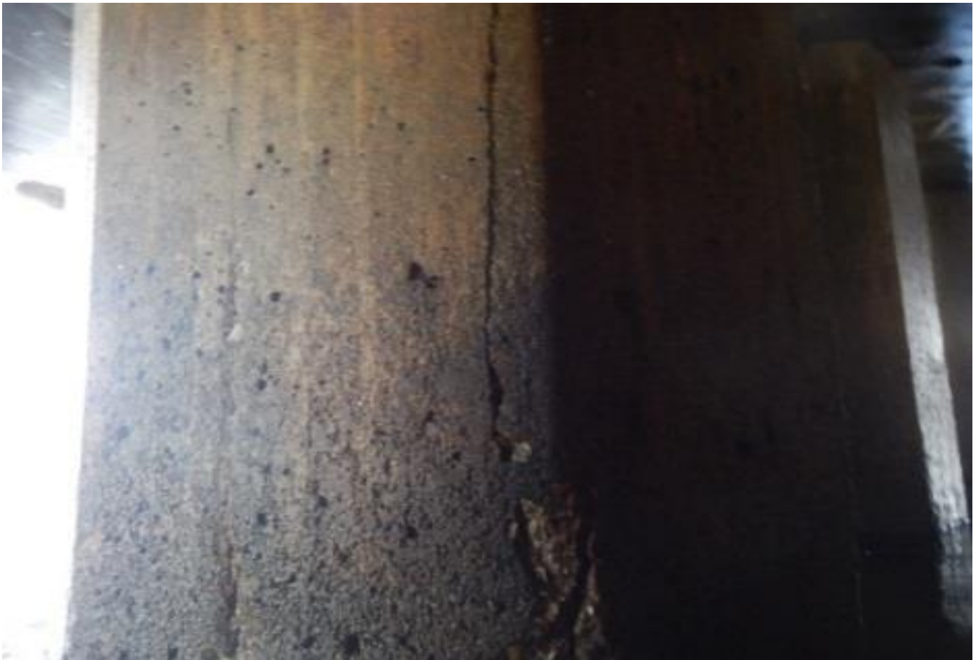
P-18, F-3,4,5,6, DELAM. 2" DEEP