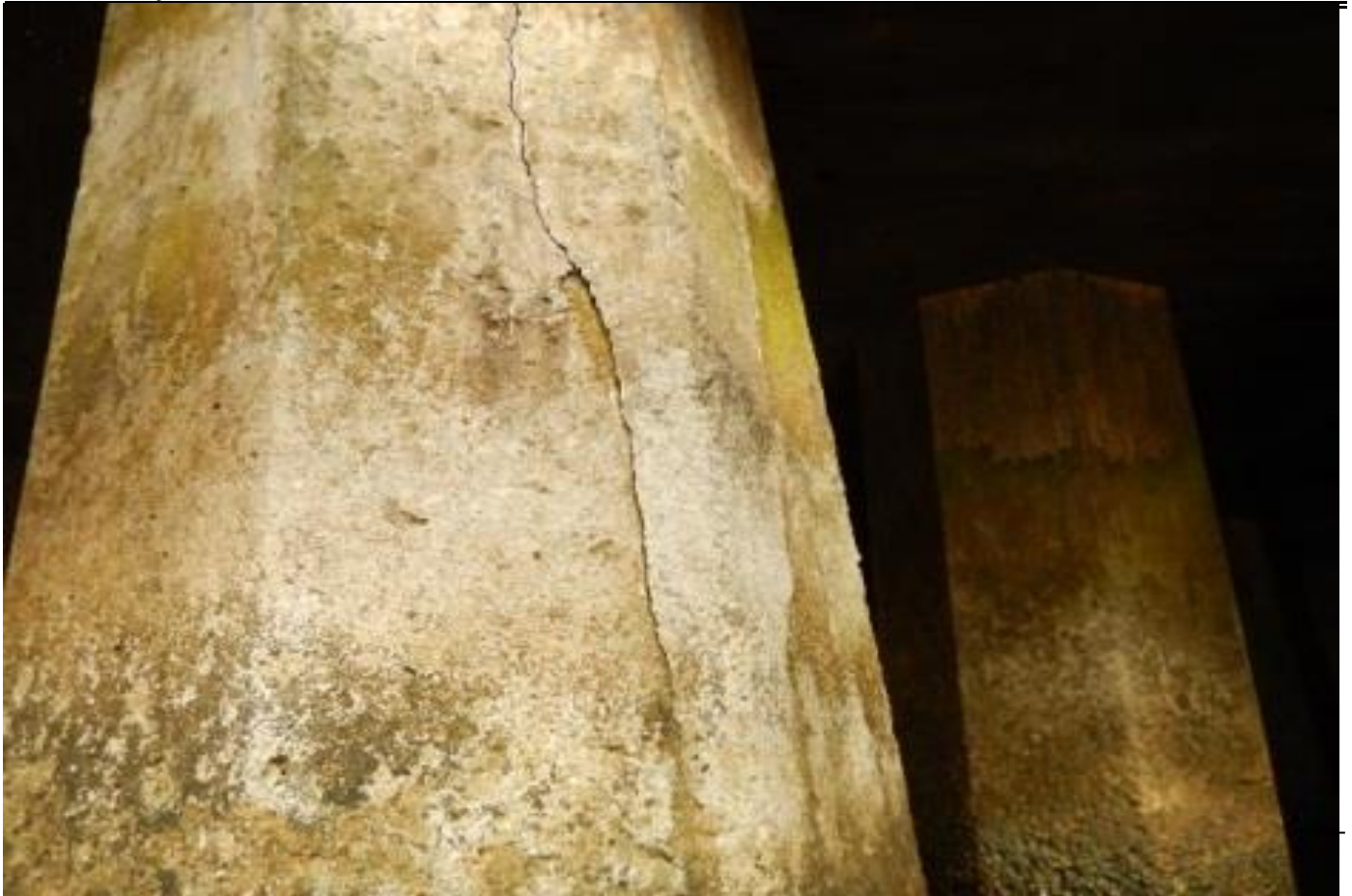
P-12, F-5,6,7, DELAM. 3" DEEP, FAILED REPAIR