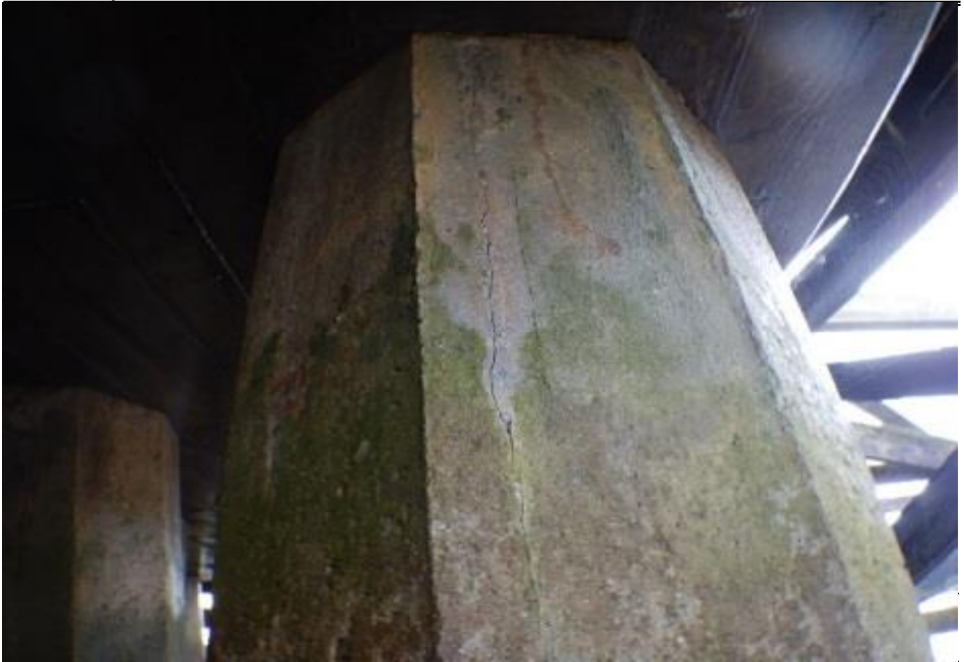
P-5, F-5,6,7, DELAMINATED 2" - 3" DEEP