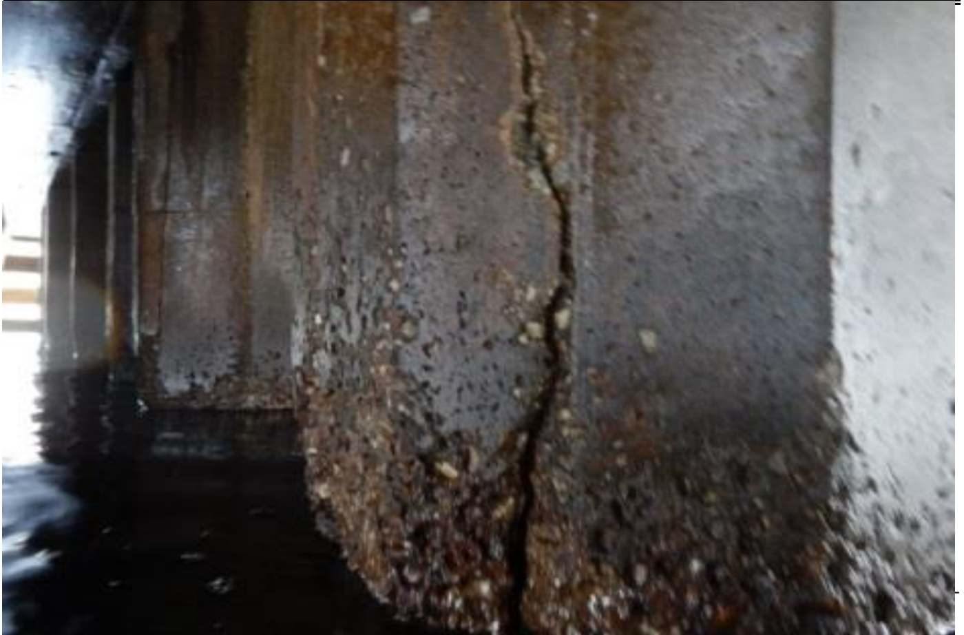
P-45, F-2,3,4,5,6,7, DELAM. 2"-3" DEEP