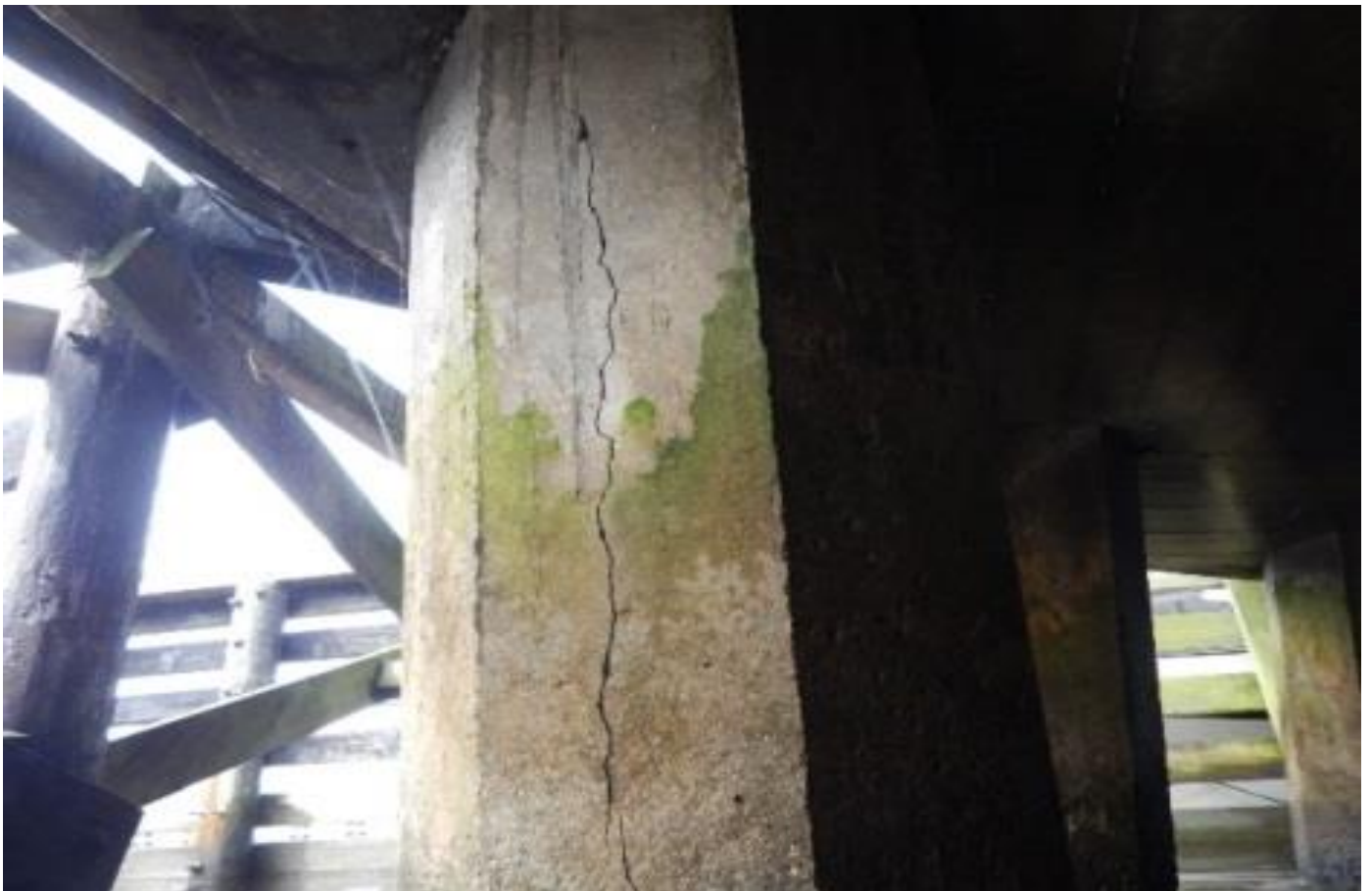
P-13, F-6,7, DELAM. 2"-3" DEEP MULTIPLE 1/16"-1/8" CRACKS