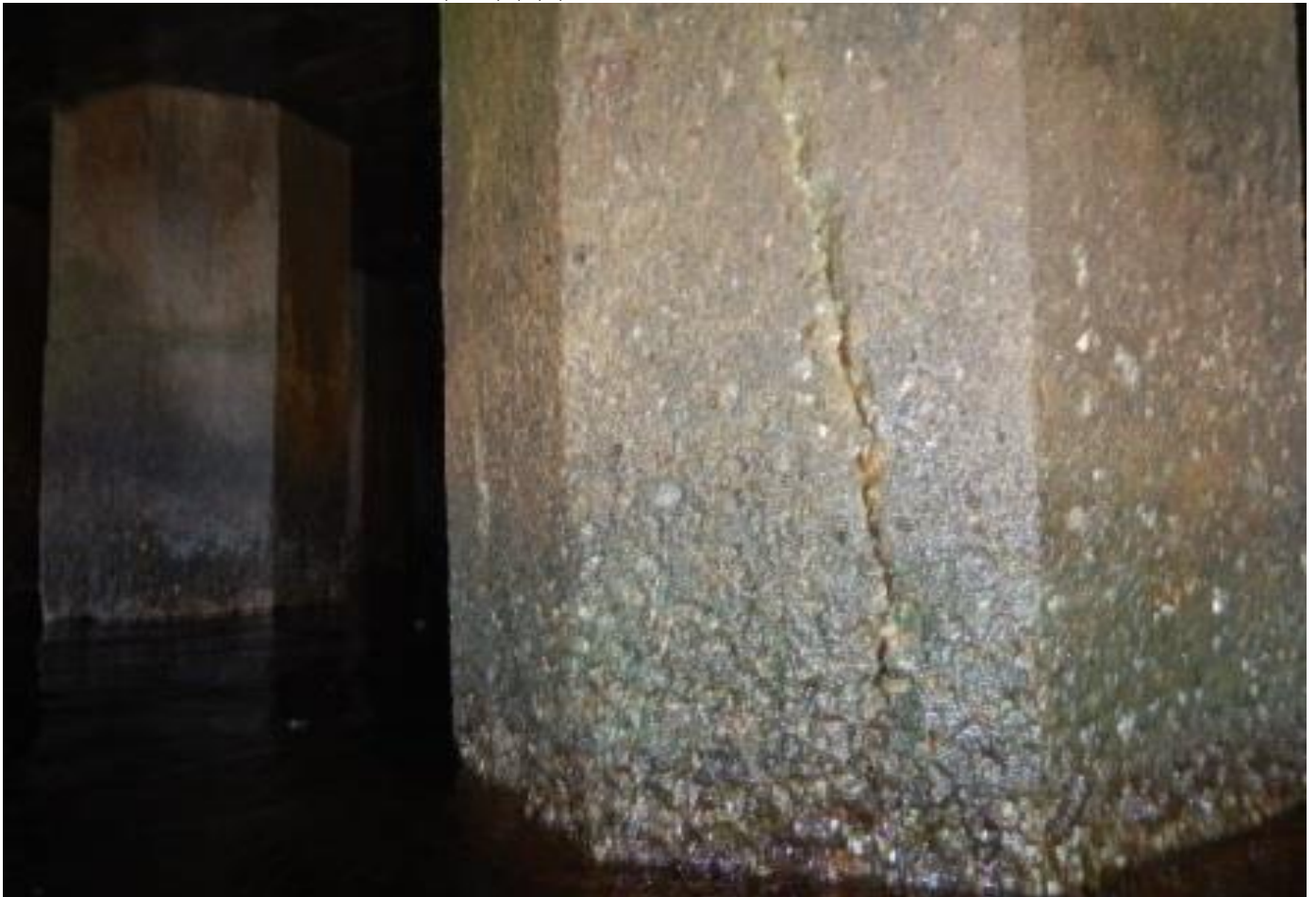
P-20, F-2,3,5,6, DELAM. 2" DEEP