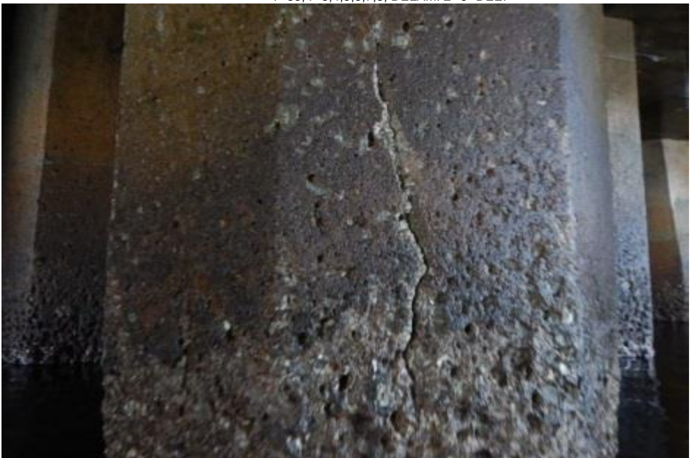
P-35, F-3,4,5,6,7,8, DELAM. 2"-3" DEEP