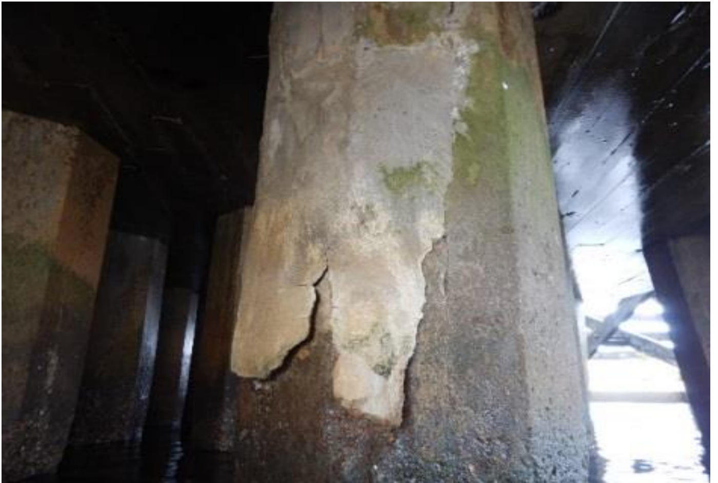
P-22, F-4,5,6,7, DELAM. 3" DEEP FAILED REPAIR