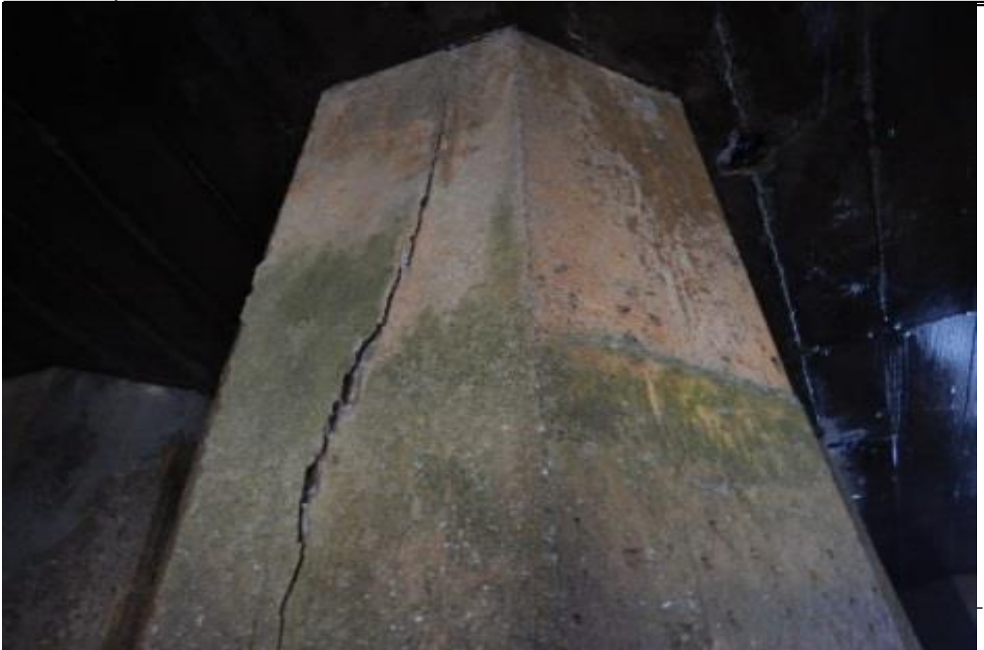
P-37, F-3,4,5,6,7,8, DELAM. 2"-3" DEEP