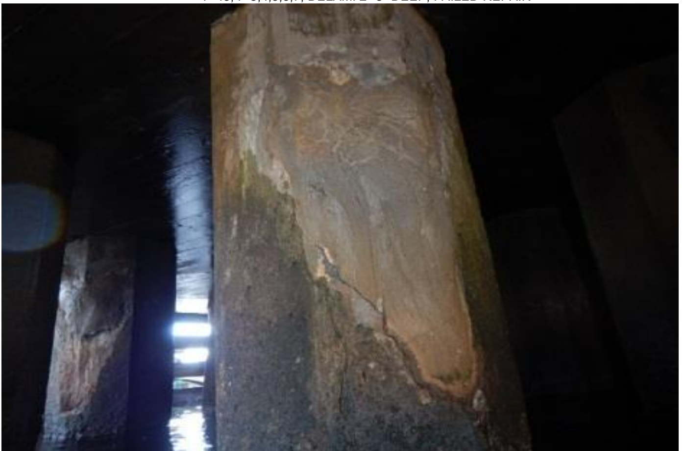
P-43, F-3,4,5,6,7, DELAM. 2"-3" DEEP, FAILED REPAIR