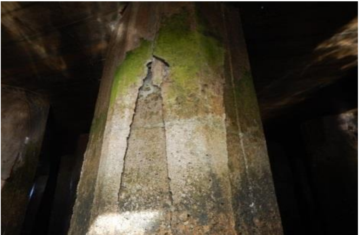
P-28, F-3,4,5,6,7, DELAM. 2"-3" DEEP, FAILED REPAIR