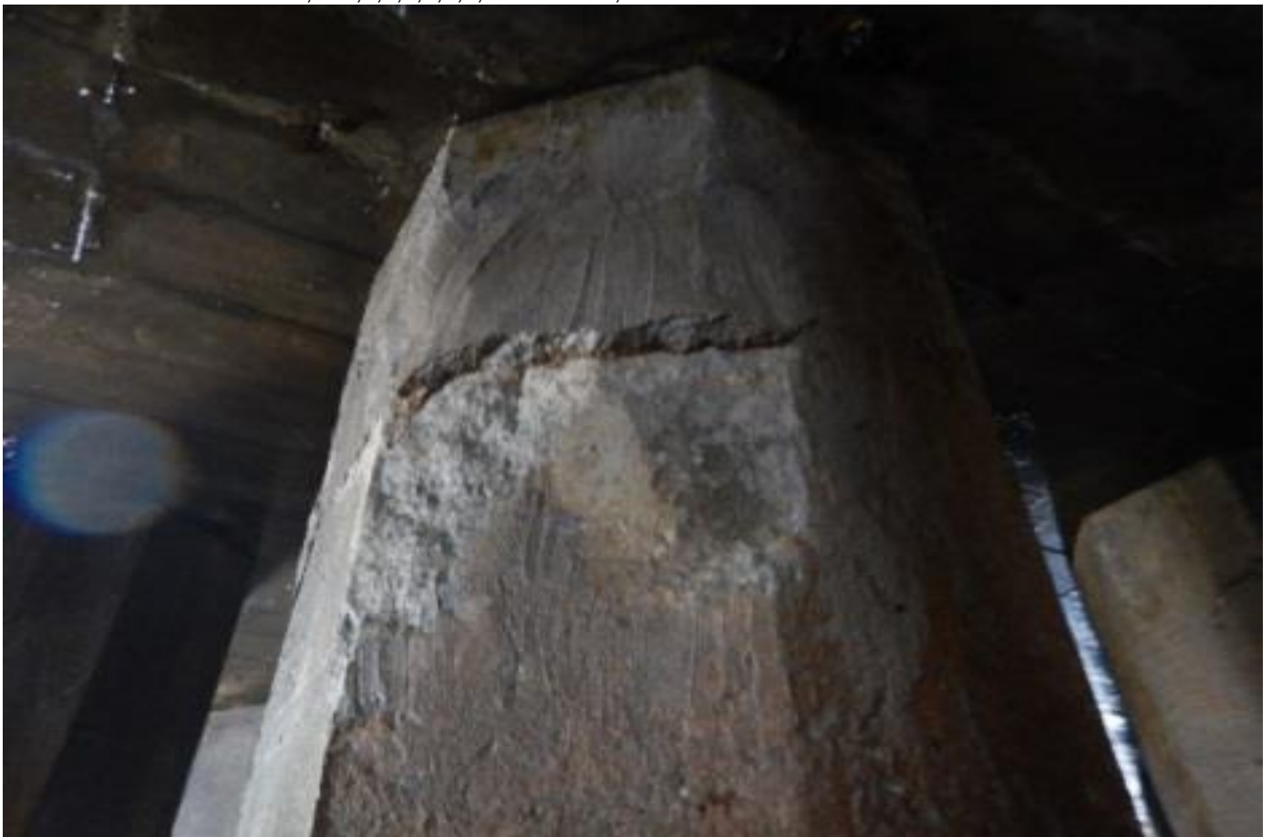
P-48, F-2,3,4,5,6,7,8, 2"-3" DEEP, FAILED REPAIR