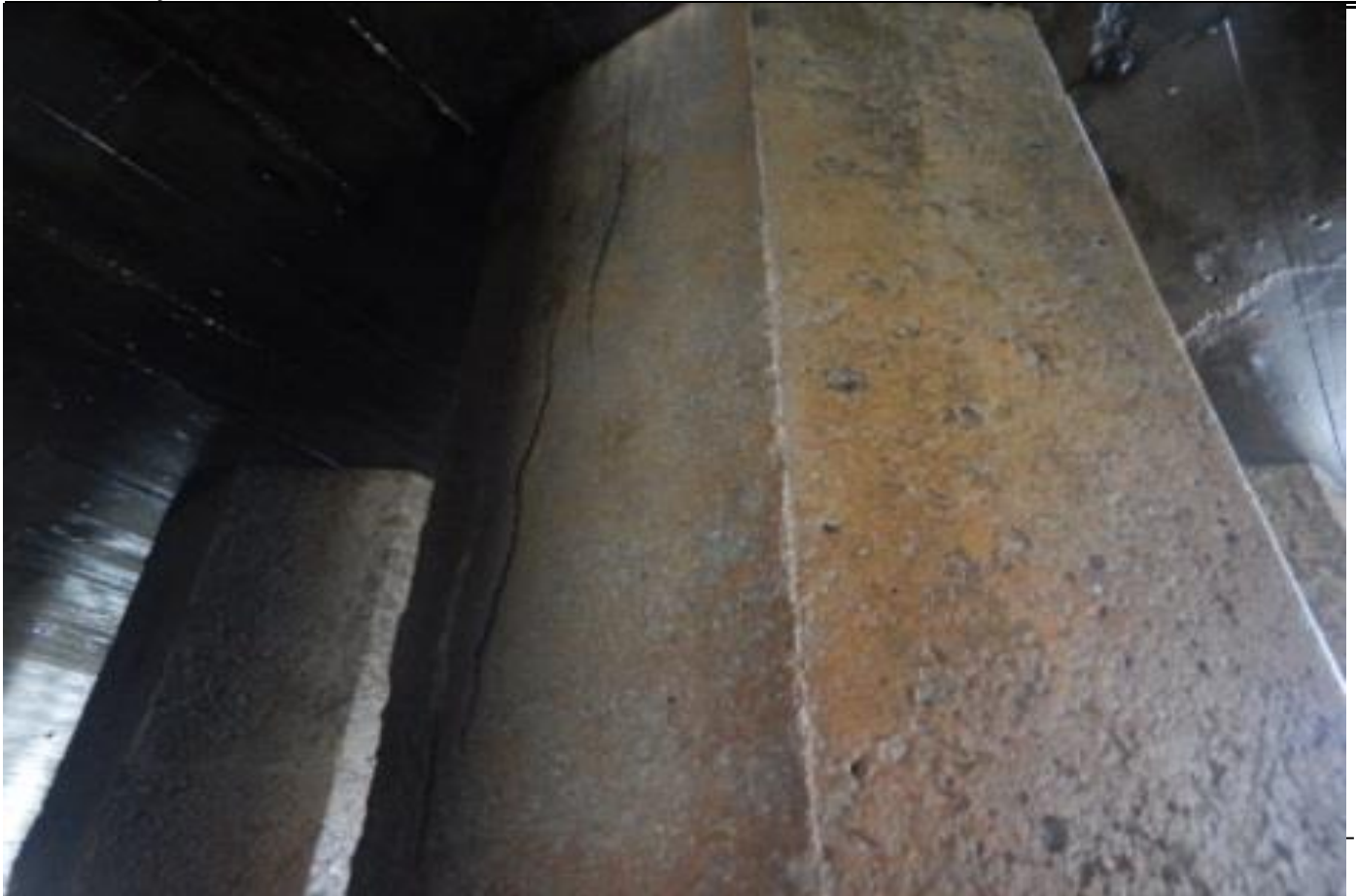
P-34, F-4,5,6,7, DELAM. 2"-3" DEEP