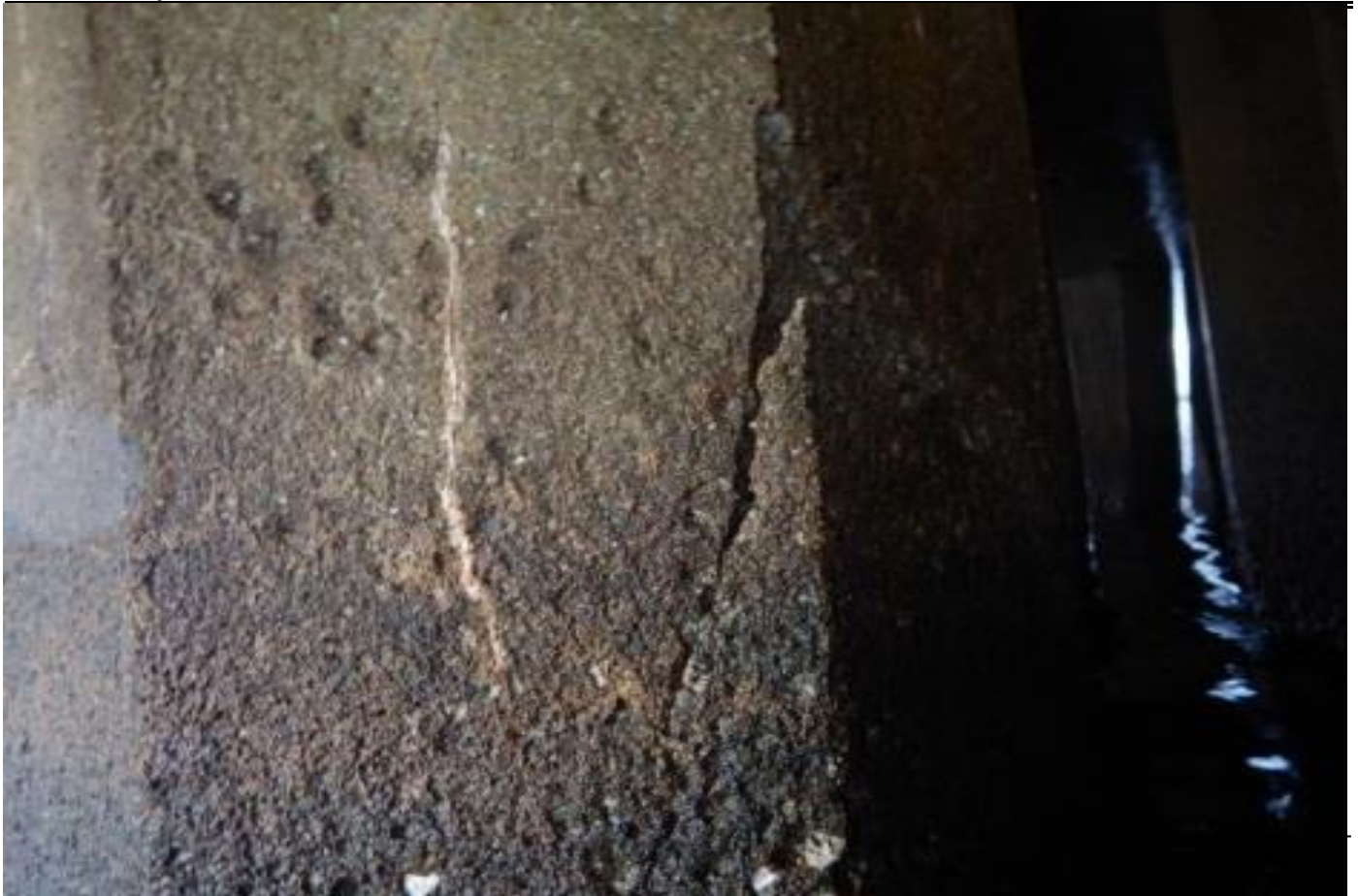
P-42, F-2,3,4,5,6, DELAM. 2"-3" DEEP