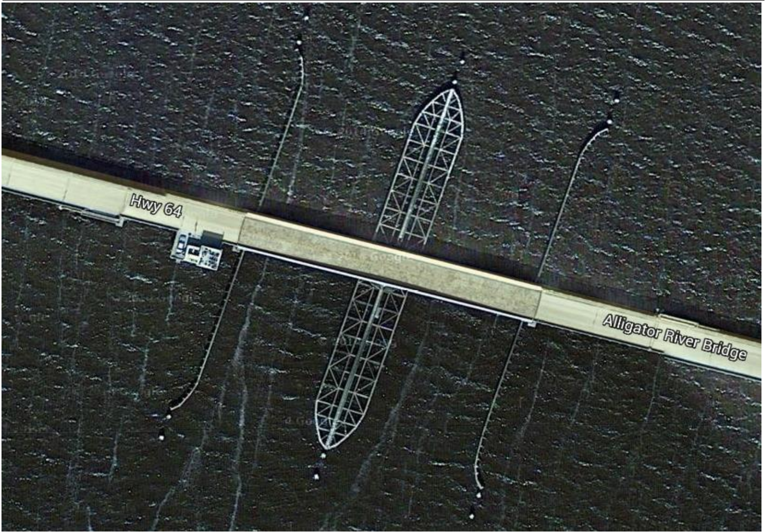
Bridge tenders house, pivot span, and fender system