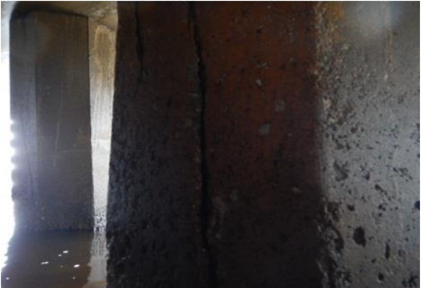
P-30, F-3,4,5,6,7,8, DELAM. 2"-3" DEEP, FAILED REPAIR