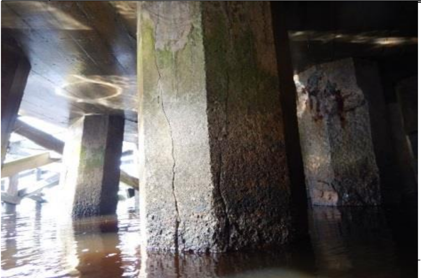
P-27, F-3,4, DELAM. 1" DEEP