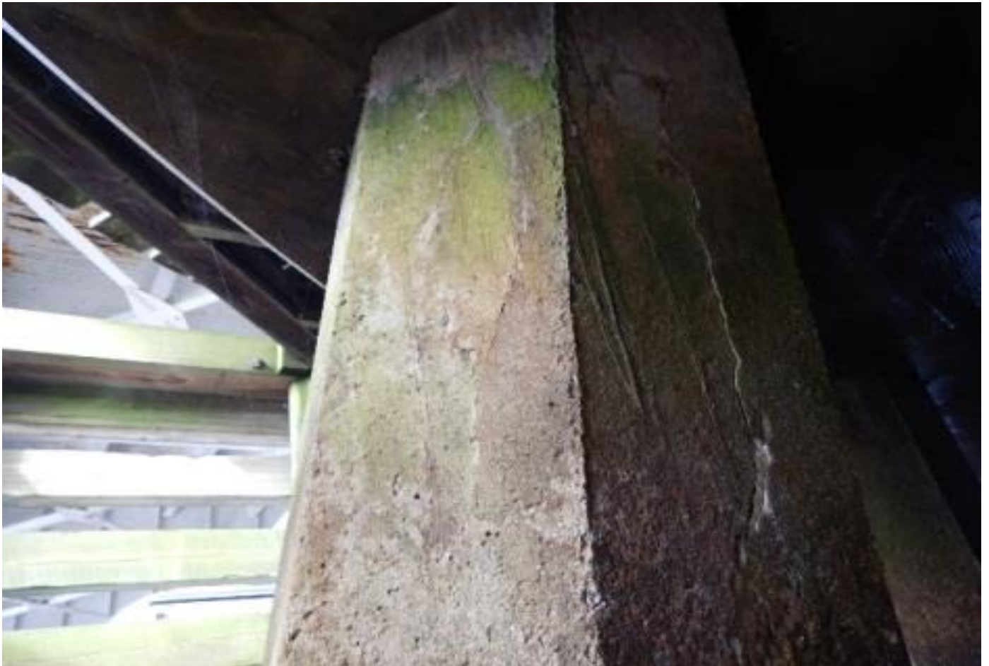
P-15, F-3,4,5,6, MULTIPLE 1/16"-1/8" CRACKS