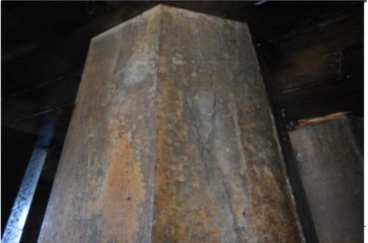
P-51, F-6,7, DELAM. 1"- 2" DEEP