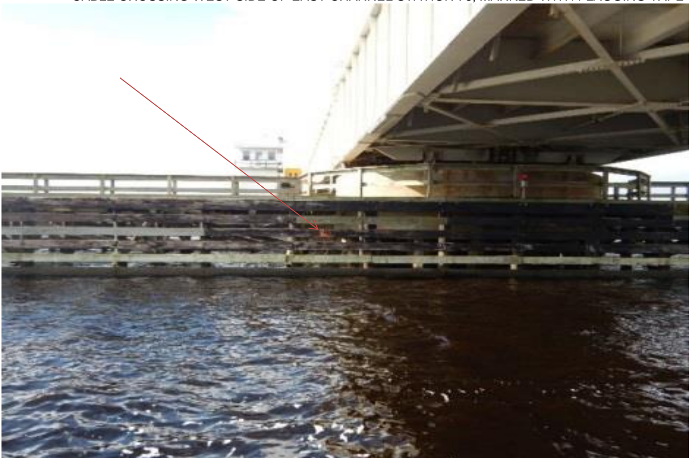
CABLE CROSSING WEST SIDE OF EAST CHANNEL STATION 76, MARKED WITH FLAGGING TAPE