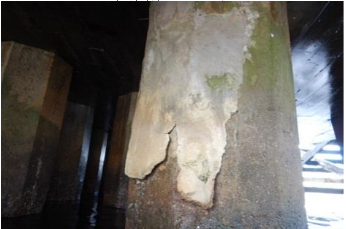
P-38, F-3,4,5,6,7,8, DELAM. 2"-3" DEEP, FAILED REPAIR