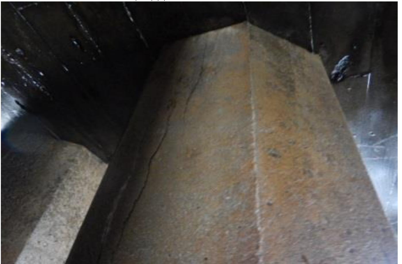
P-46, F-1,2,3, DELAM. 2" DEEP