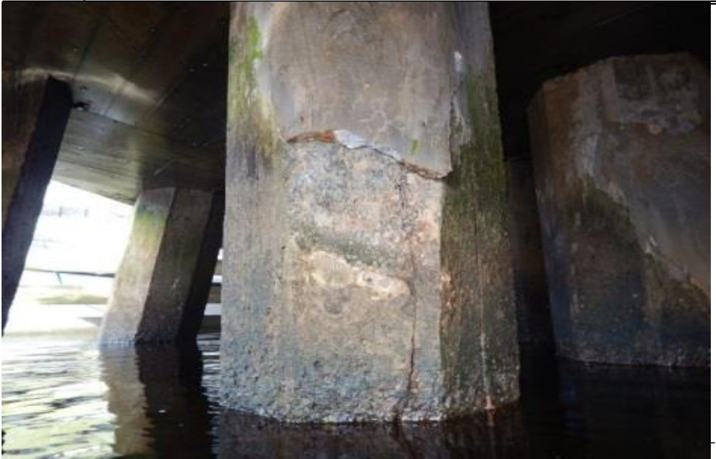
P-29, F-3,4,5,6,7, DELAM. 2"-3" DEEP, FAILED REPAIR