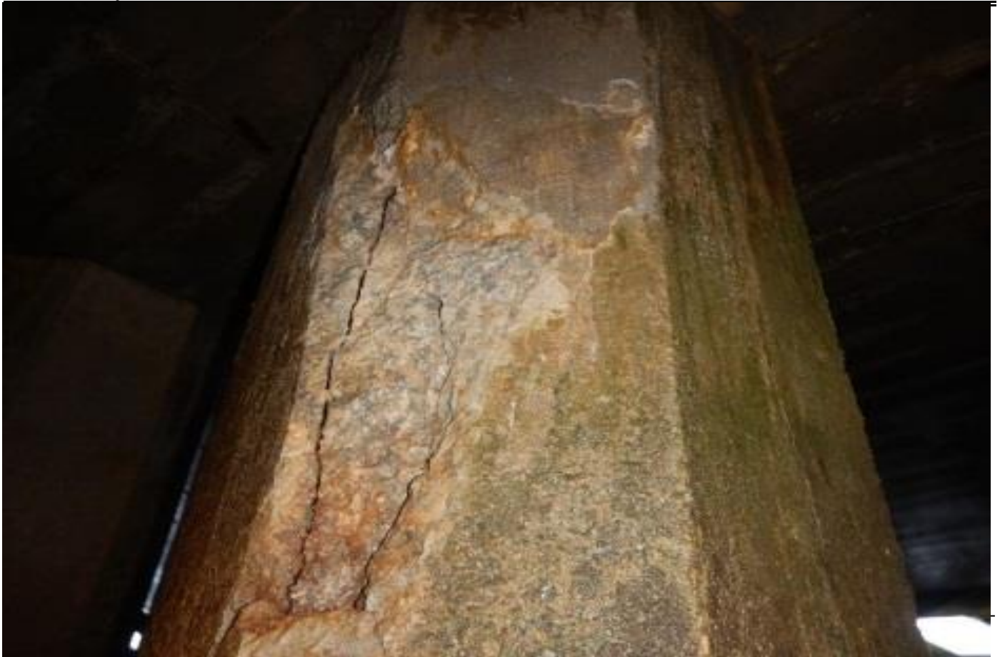
P-39, F-2,3,4,5,6,7, DELAM. 2"-3" DEEP, FAILED REPAIR