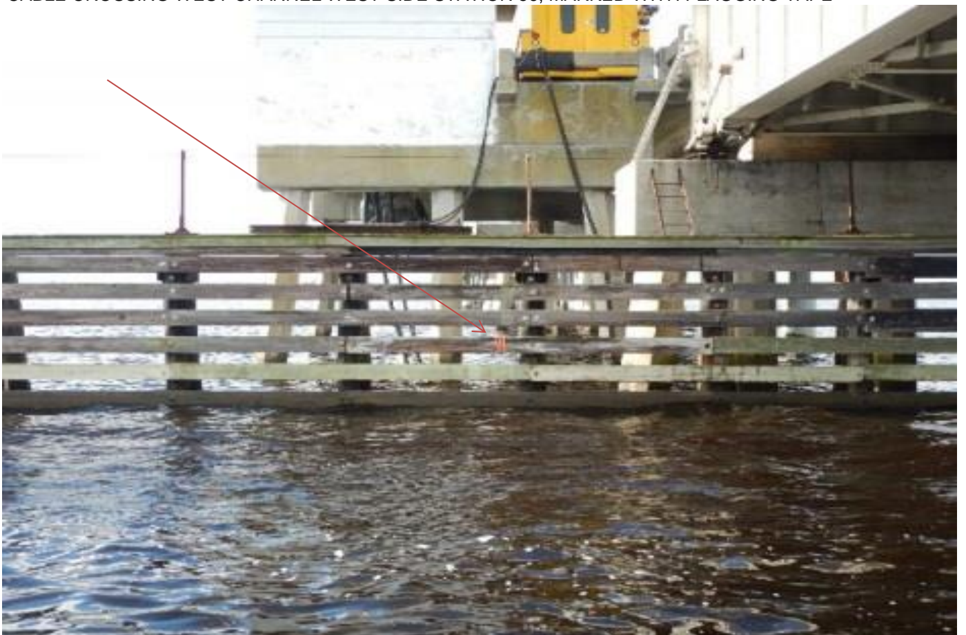
CABLE CROSSING WEST CHANNEL WEST SIDE STATION 56, MARKED WITH FLAGGING TAPE