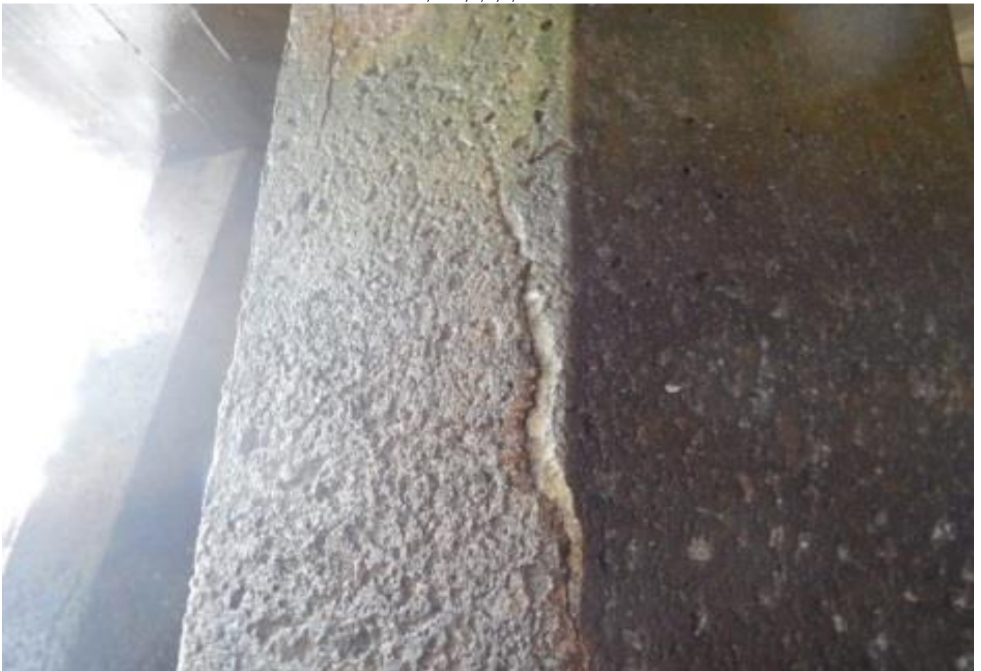
P-26, F-4,5,6,7, DELAM. 2" DEEP