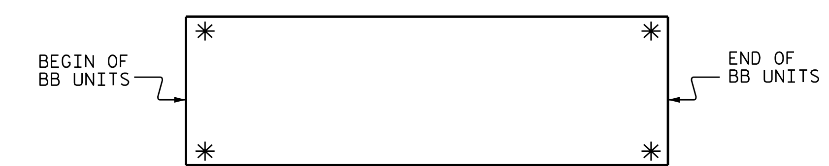
SKETCH SHOWING POINTS OF ATTACHMENT * LOCATION OF GUARDRAIL ATTACHMENT