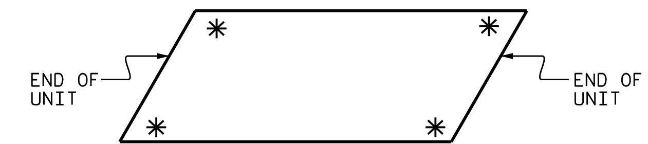
SKETCH SHOWING POINTS OF ATTACHMENT