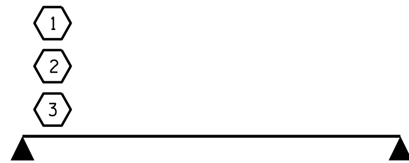
LRFR SUMMARY FOR SPANS 'A' & 'C'

PROJECT NO. B-5331 COLUMBUS COUNTY STATION: 15+20.00 -L-