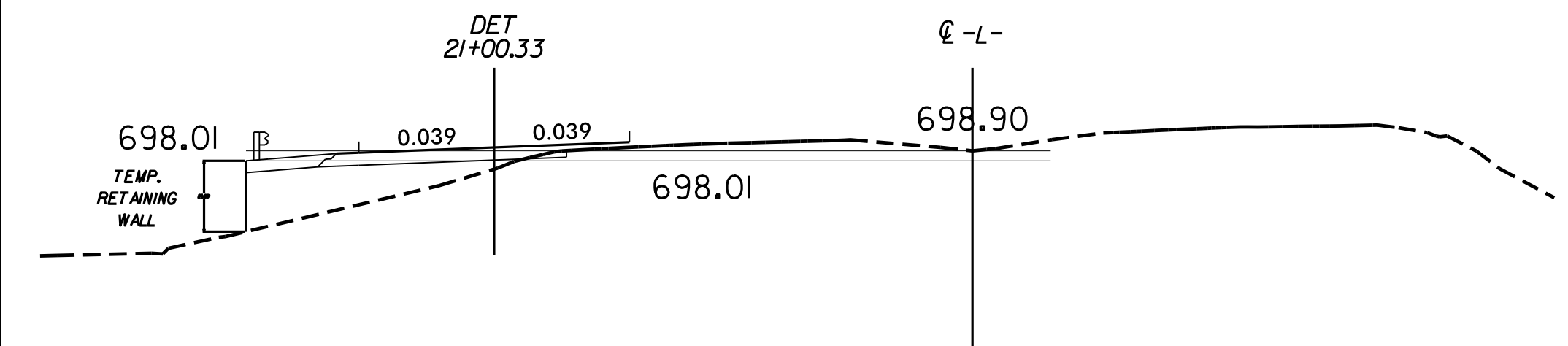
SECTION THRU WALL