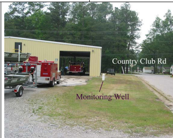
Site 2: Stoney Creek Fire Department. View to the West.