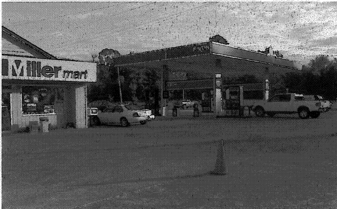
Photo 2. View of property, facing east/southeast. The orange cone marks the location of boring GP-3D.