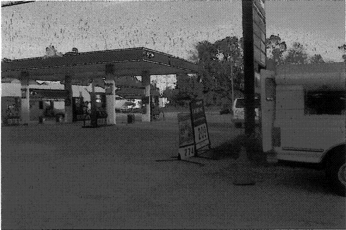
Photo 3. View of property, facing east/northeast. The orange cone marks the location of boring GP-4D.