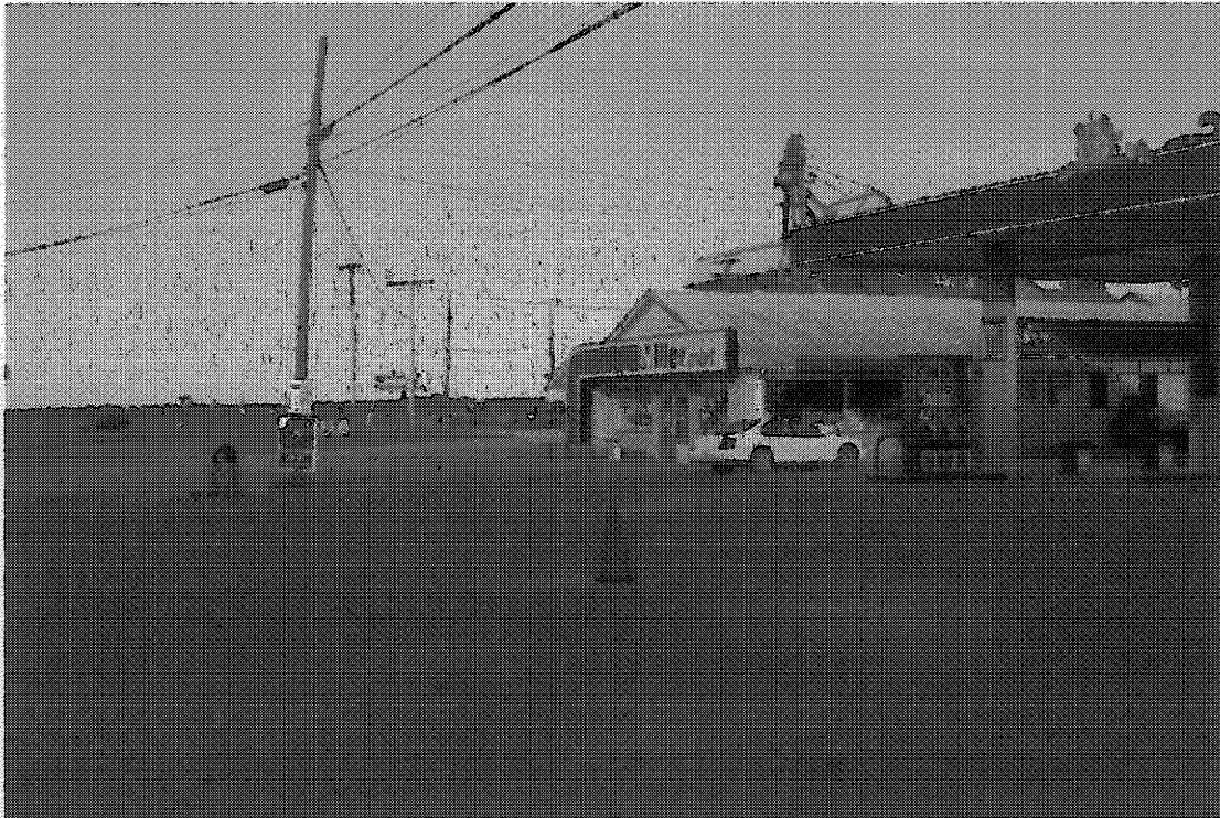
Photo 1. View of property, facing northeast. The orange cone in the foreground marks the location of boring GP-1D, and the cone in the background marks the location of GP-2D.