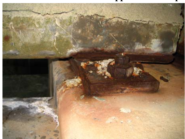
Span 176; East elevation; close up of BRNG