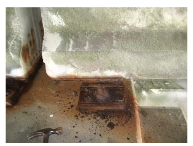
Span 176; West elevation