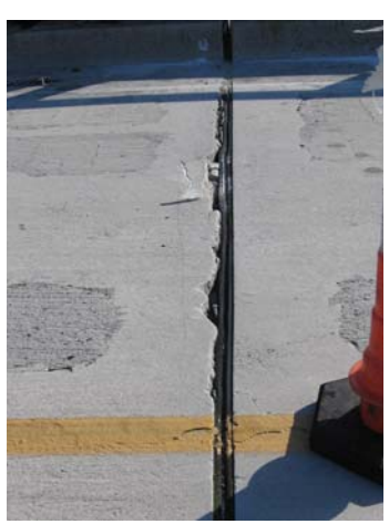
Span 116; deck surface