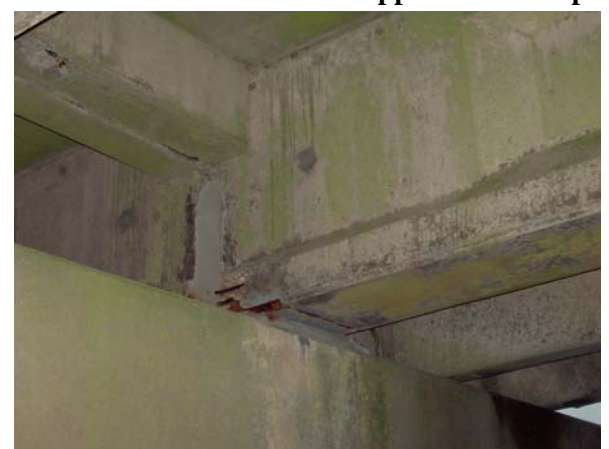
Bent 5, Girder #1: SP & ES south face