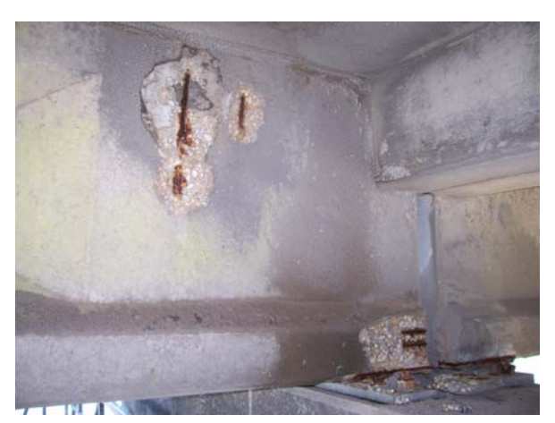
Span 54; East elevation