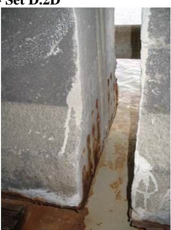
Span 176; Girder