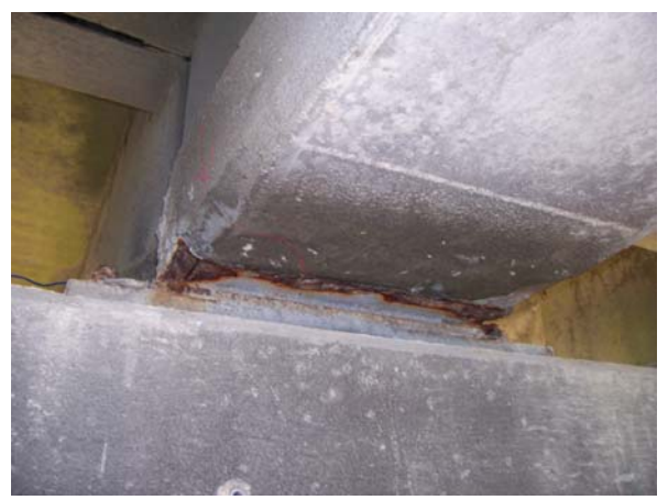
Span 54; West elevation