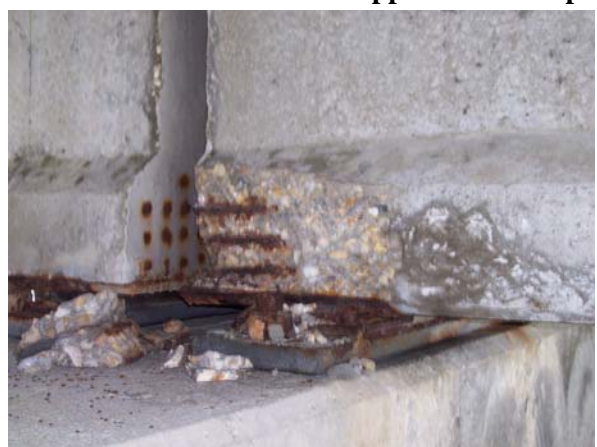
Span 65; West elevation