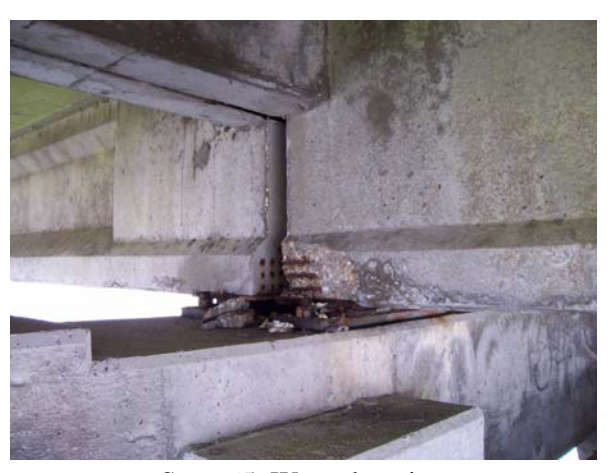
Span 65; West elevation