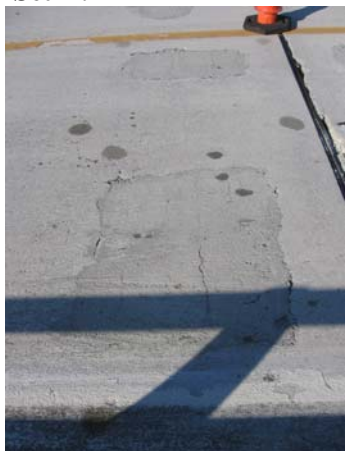
Span 117; deck surface