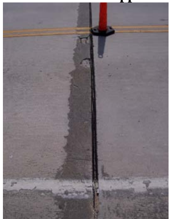
Span 102; deck surface