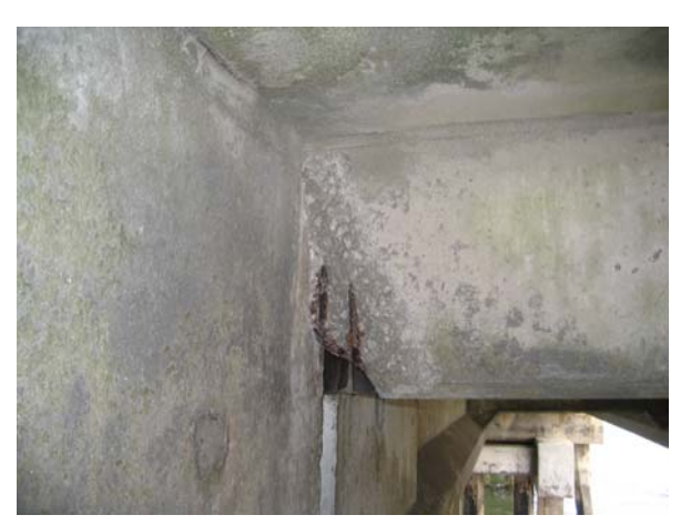
Span 176; deck soffit; south