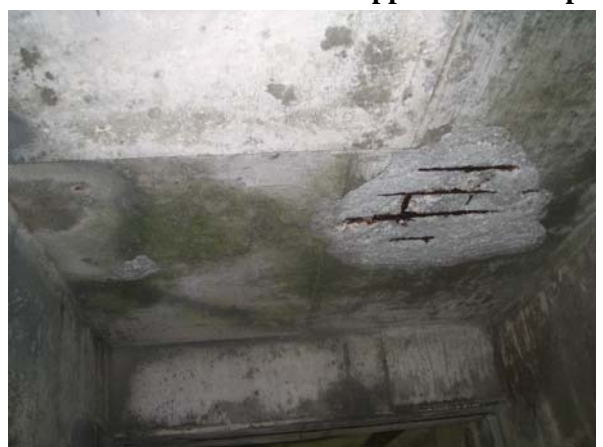
Span 176; deck soffit