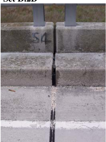
Span 54; deck surface