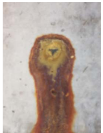
Span 93; West elevation