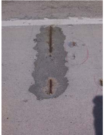
Span 102; deck surface