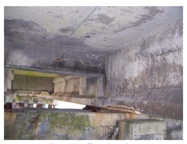
Span 116; East elevation