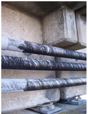
Span 32; east elevation