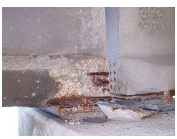
Span 54; East elevation