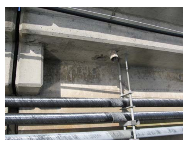
Span 93-94, South deck core