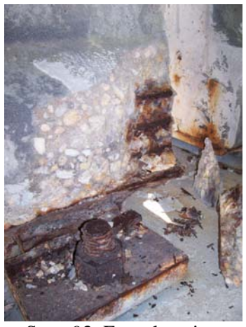
Span 93; East elevation