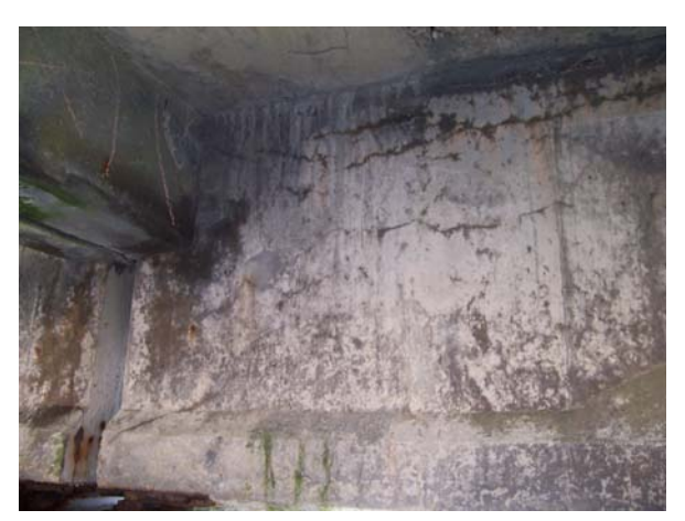
Span 117; East elevation