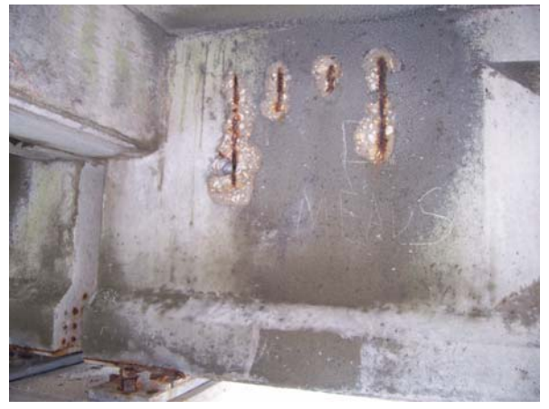
Span 65; West elevation