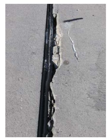
Span 116; deck surface; bad raveled edge