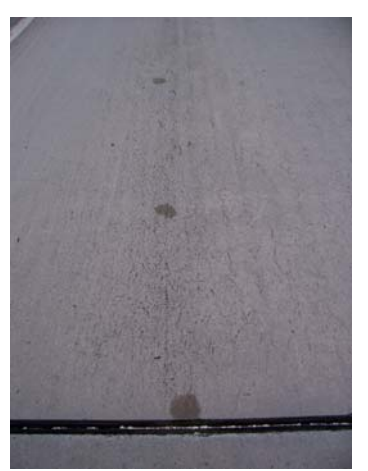
Span 35; deck surface