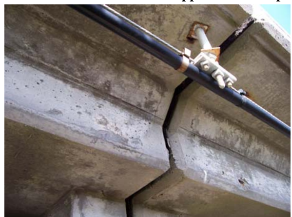
Span 54; deck soffit