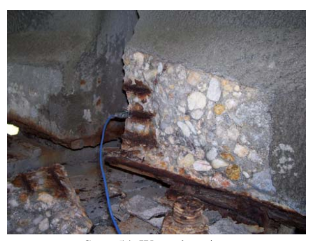
Span 54, West elevation