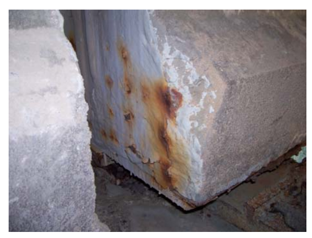
Span 48; Showing cracking at end of girder