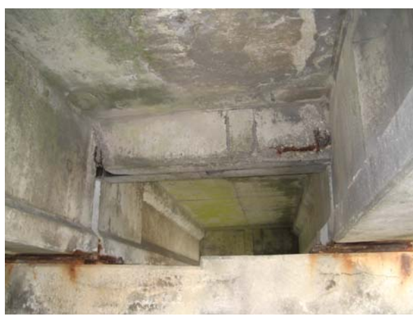
Span 176; deck soffitt; south