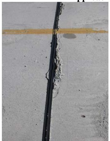
Span 117; deck surface