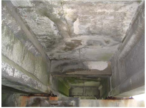
Span 176; deck soffit; north