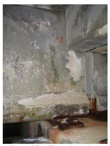
Span 176; East elevation