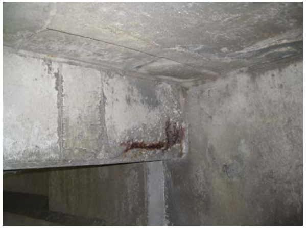
Span 176, deck soffit; south