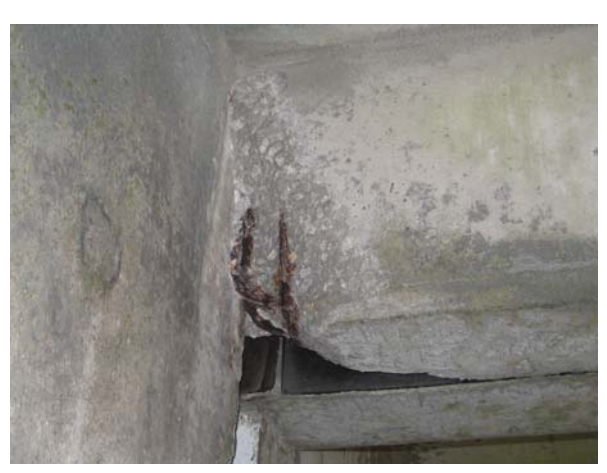
Span 176; deck soffit; south