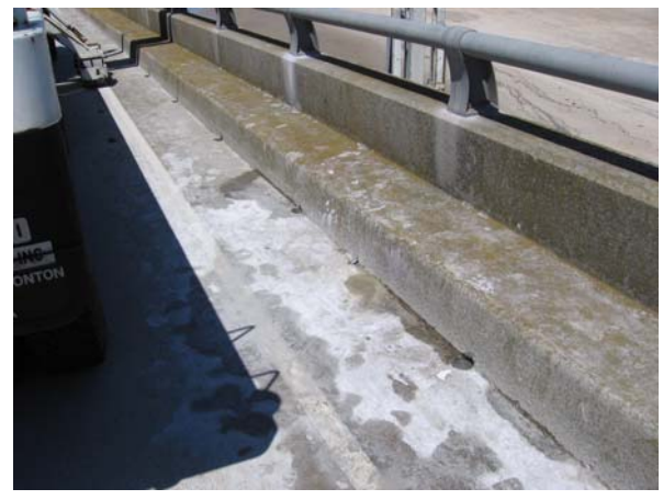
Span 116-117, Midspan deck core