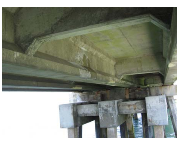
Span 175-176, Girder #3 core