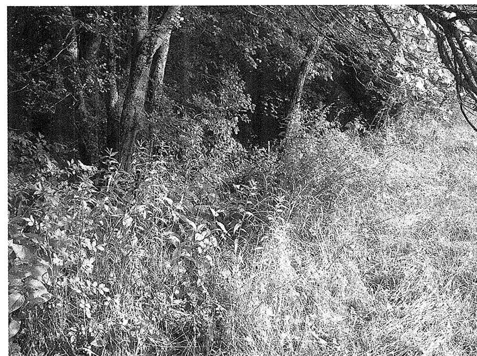
VIEW LOOKING NORTH ALONG END BENT -2