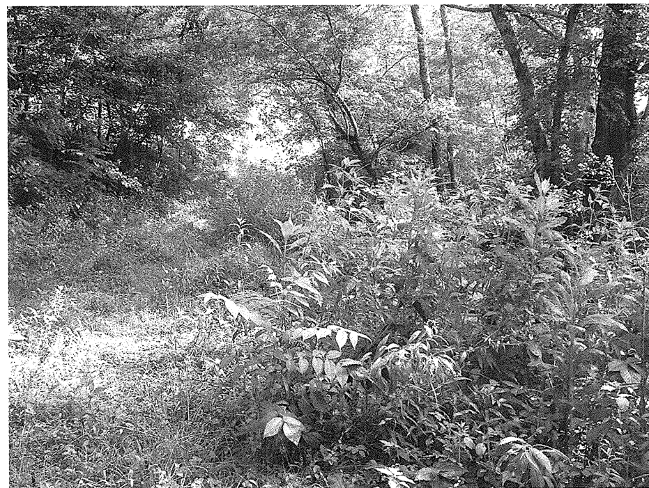
VIEW LOOKING NORTH ALONG END BENT - 1