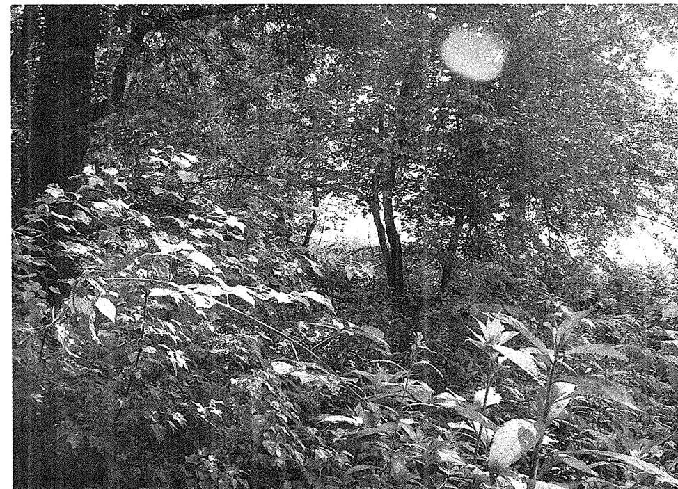
VIEW LOOKING EAST ALONG CENTERLINE -DET-