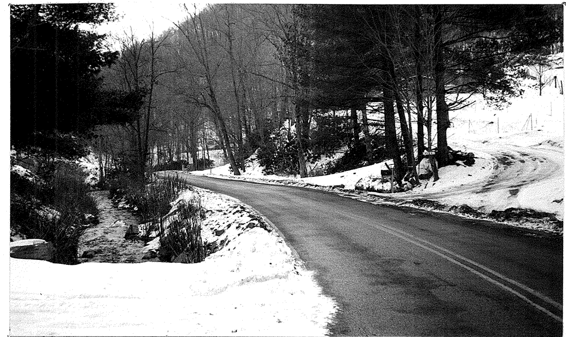
Figure 2: Looking forward from a point Left of -L- Station 14+50