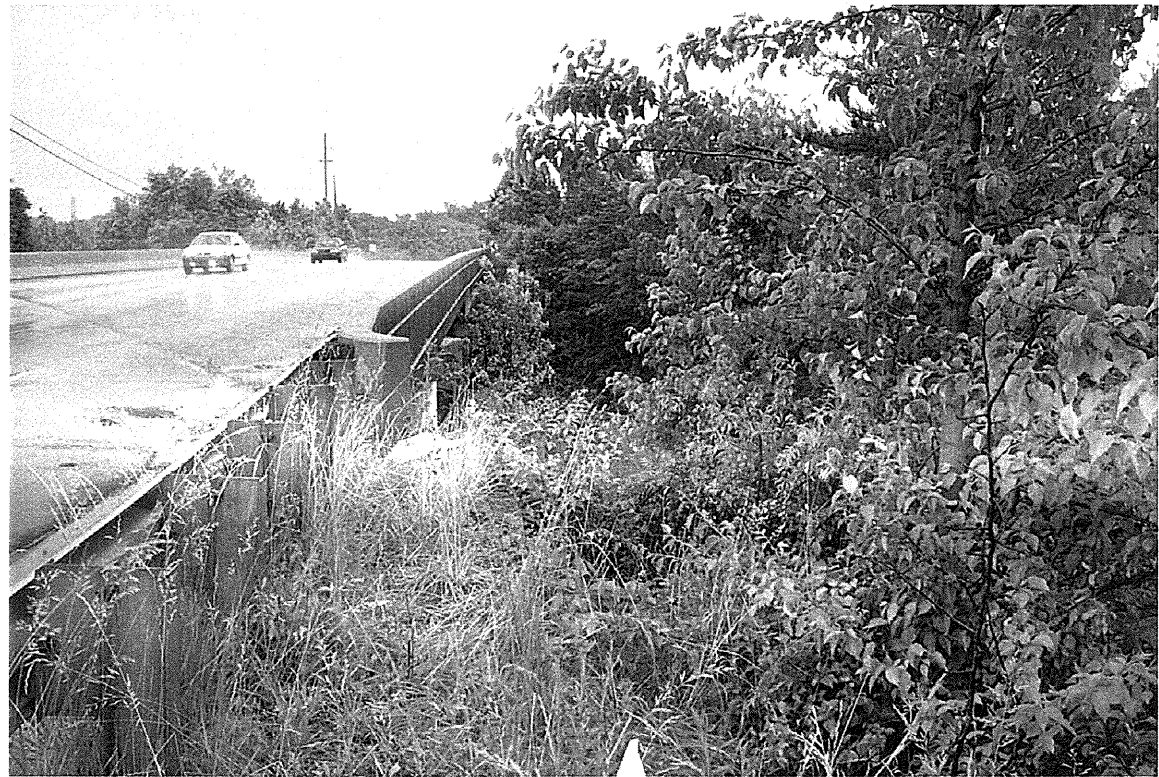
Photograph 1: View 9m Right of -L- from North of End Bent-1

Widening of Bridge No. 57 over NSRR on NC 274 between Isley Drive and Delta Drive STATE PROJECT NO. 8.1811201 (U-2408) WBS ELEMENT NO. 34799.1.1