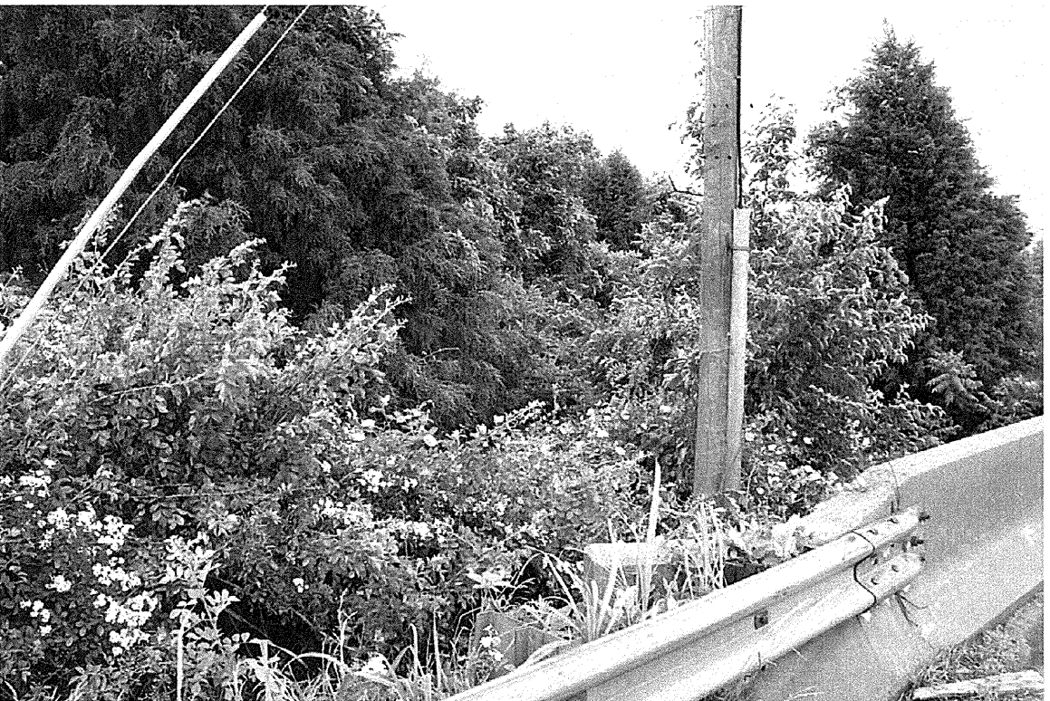
Photograph 4: View Along End Bent-1 From Edge of Road Toward EB1-A Plan