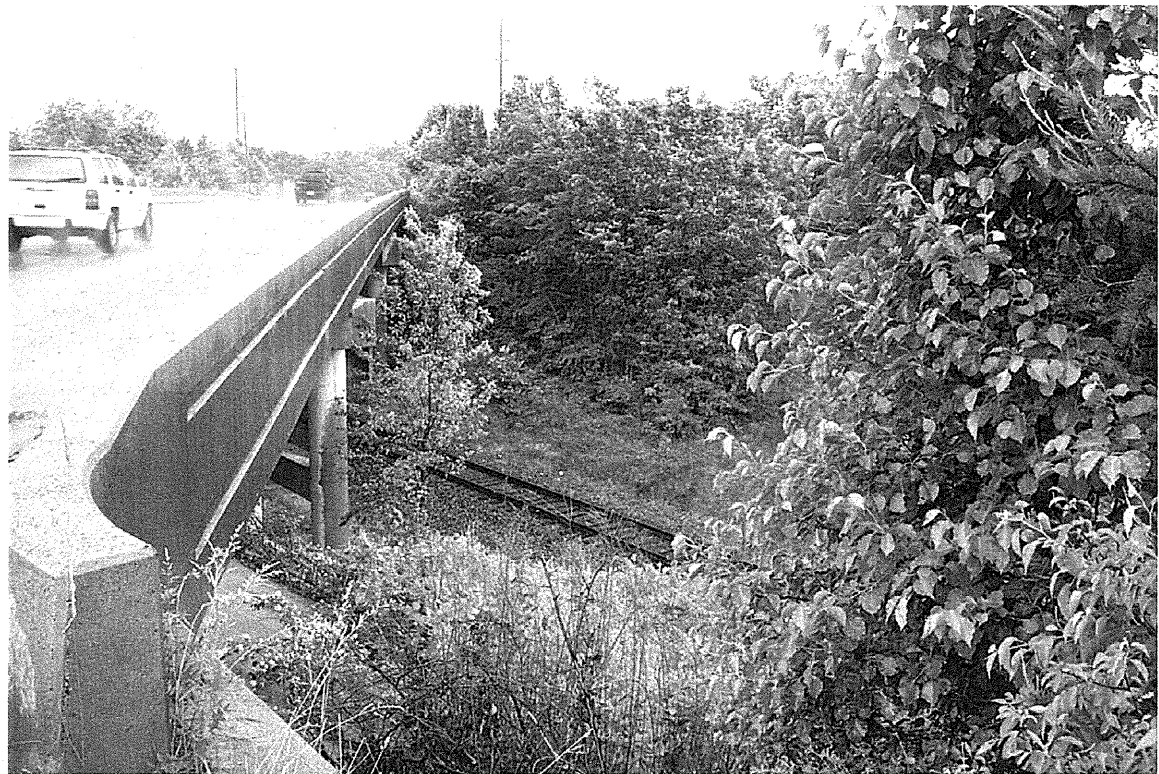
Photograph 2: View 9m Right of -L- From Top of Embankment at End Bent-1