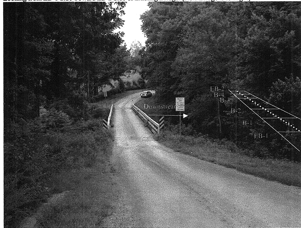
Looking from EB-1 Side Toward EB-2 Side of Existing Bridge. (New Bridge is to Right)