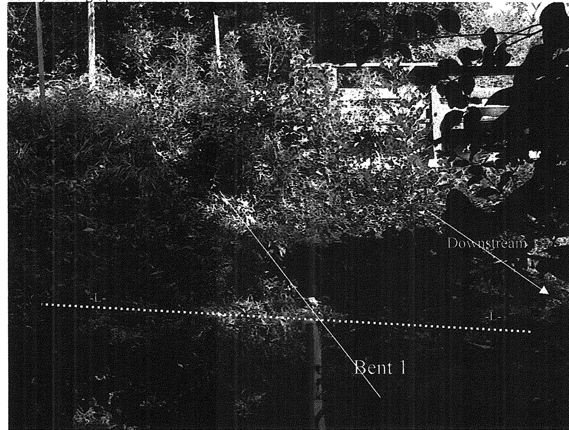
Bent 1, Looking Upstream