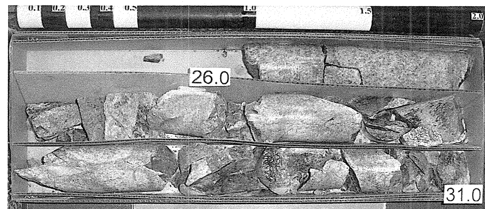
Box 4 of 7