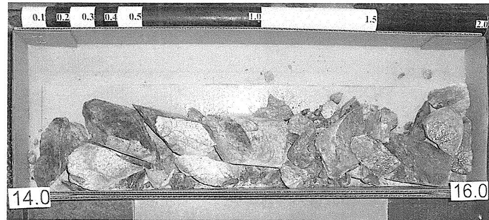
Box 1 of 7