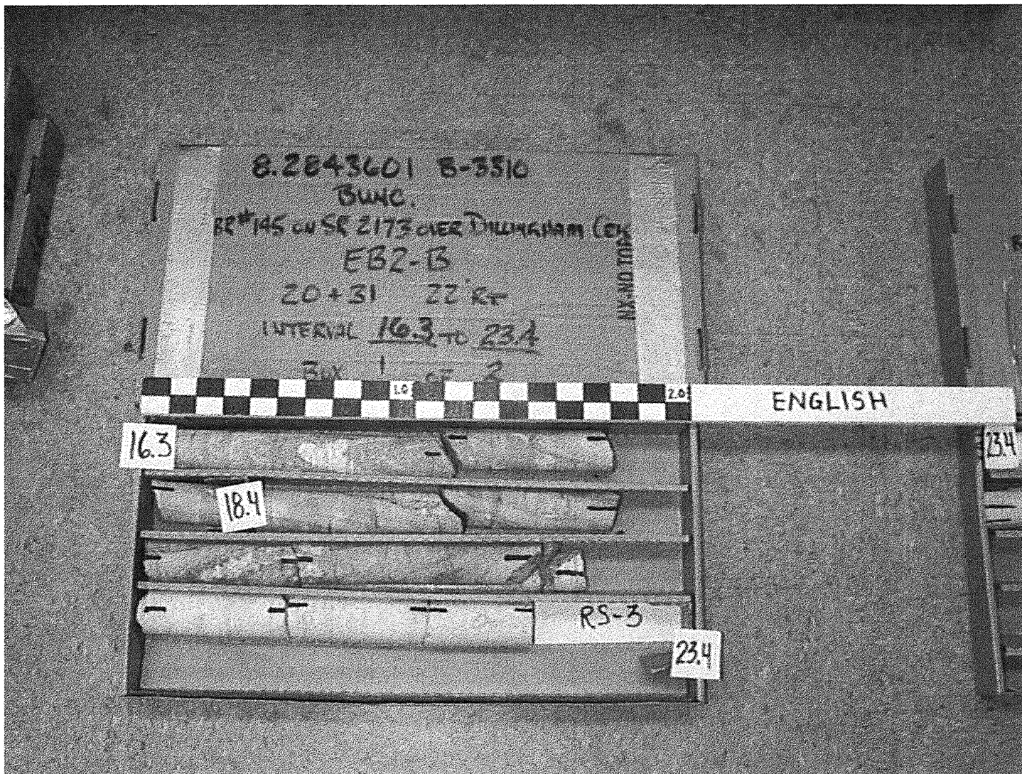
8.2843601 B-3310 Buncombe County Bridge N0.145 on SR-2173 over Dillingham Creek. EB2-B 1 of 2