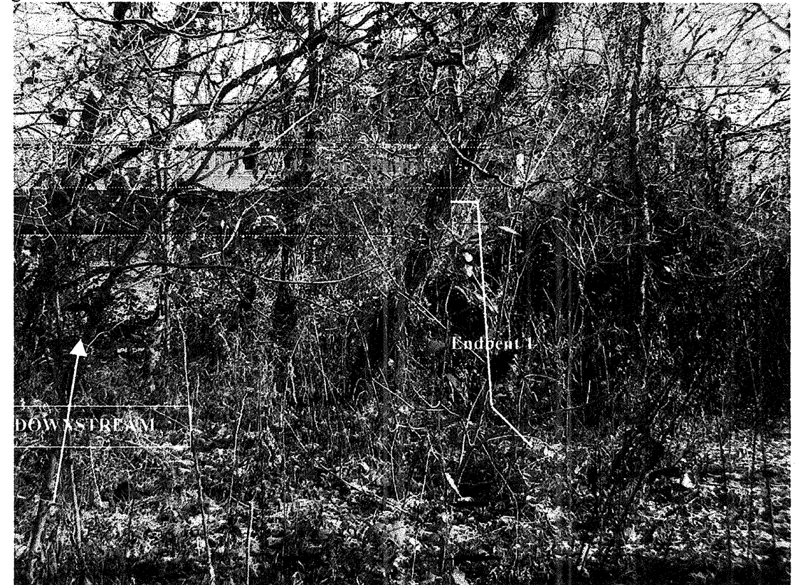
Looking Downstream at End Bent 1