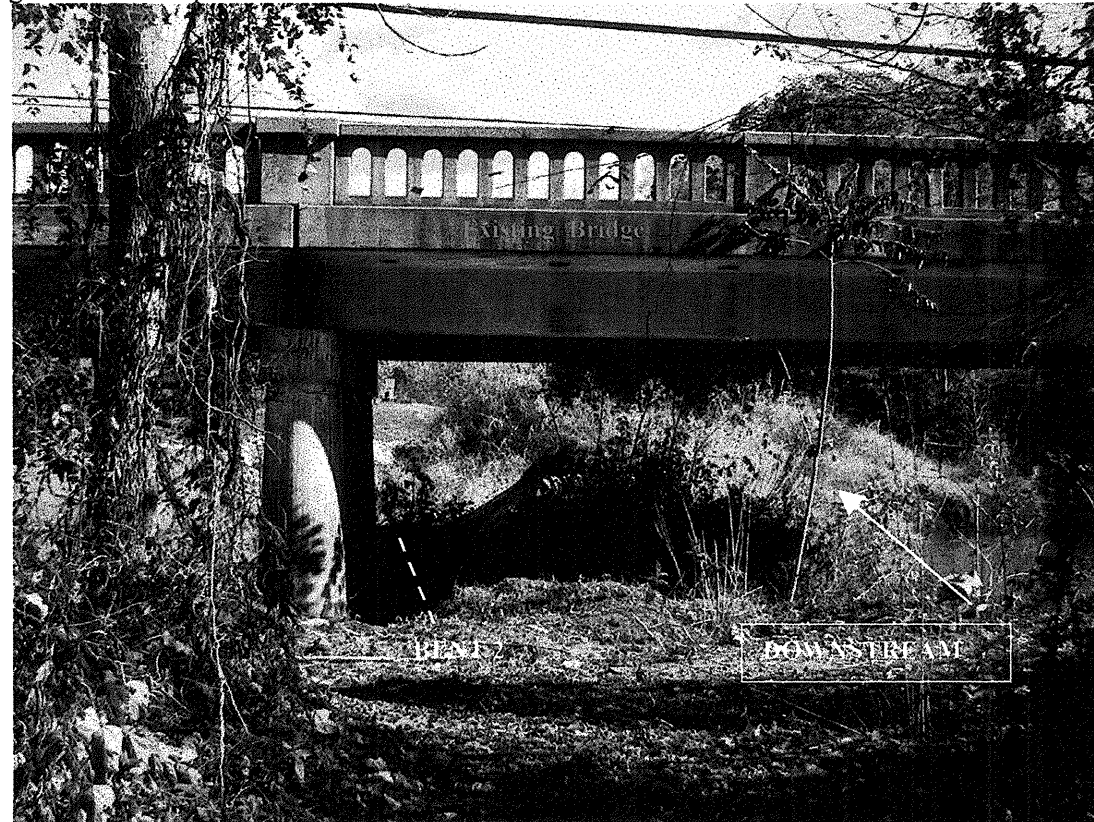
Looking downstream at planned Bent 2 location