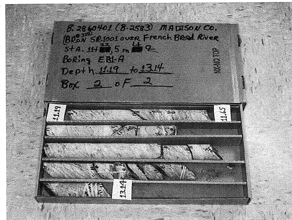
8.2860401 (B-2583) BRIDGE NO. 328 ON SR-1001 OVER FRENCH BROAD RIVER (MADISON COUNTY)